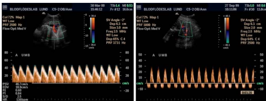
Figure 1. Doppler recording of blood flow velocities recorded from the umbilical artery. Reversed end-diastolic blood flow in the umbilical artery. 1 a) Normal blood flow velocity waveform with positive diastolic velocity and low pulsatility index (0.84) indicating low resistance to flow in the placenta. 1 b) Reversed end-diastolic blood flow velocity.

Serial Doppler examinations of the umbilical artery, MCA and DV together with assessment of fetal heart rate (FHR) variability, provide information facilitating the clinical decision on when to deliver the IUGR fetus in the second trimester. At present, there is an on-going multicenter randomised clinical trial called TRUFFLE, that investigates three management protocols based on the early or late ductus venosus blood flow changes and short term fetal heart rate variability for indication of intervention in preterm IUGR fetuses. 27