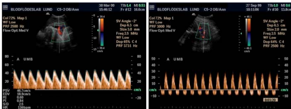
Figure 1. Doppler recording of blood flow velocities recorded from the umbilical artery. Reversed end-diastolic blood flow in the umbilical artery. 1 a) Normal blood flow velocity waveform with positive diastolic velocity and low pulsatility index (0.84) indicating low resistance to flow in the placenta. 1 b) Reversed end-diastolic blood flow velocity.

Serial Doppler examinations of the umbilical artery, MCA and DV together with assessment of fetal heart rate (FHR) variability, provide information facilitating the clinical decision on when to deliver the IUGR fetus in the second trimester. At present, there is an on-going multicenter randomised clinical trial called TRUFFLE, that investigates three management protocols based on the early or late ductus venosus blood flow changes and short term fetal heart rate variability for indication of intervention in preterm IUGR fetuses. 27