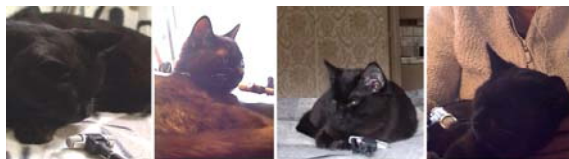
Figure 1. The microphone positions of all four cats during data collection.

Videos are available at http://purring.org