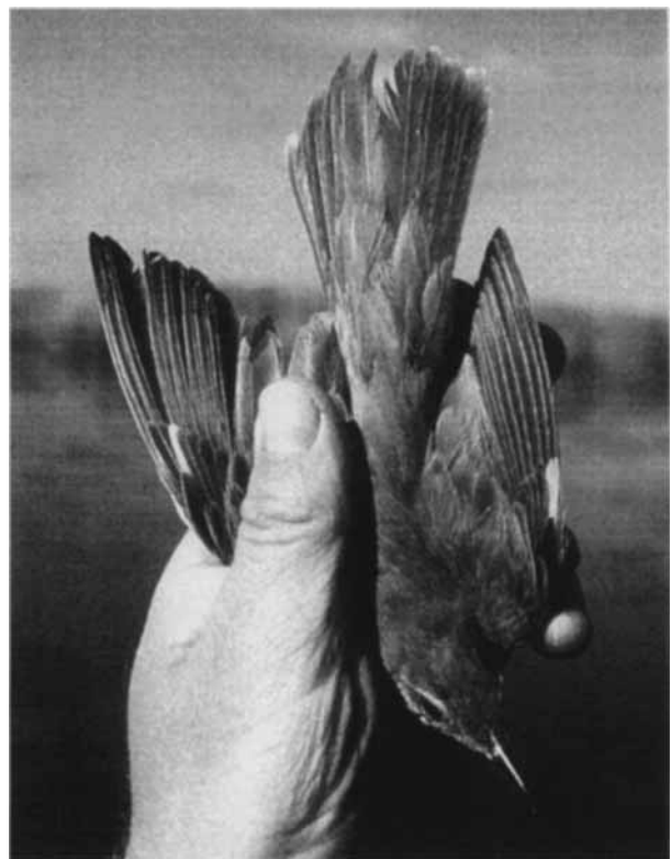
Fig. 1. Female great reed warbler showing partial albinism (individual V-14 in Table 1).

All five birds encountered with albinistic feathers entered the local population during the 1980ies (Fig. 2), however two lived up to 1990 (Table 1). This distribution is significantly different from the null