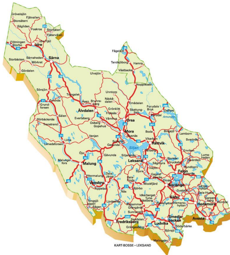
Map 2: The province of Dalarna and the territory where Övdalian is spoken 2