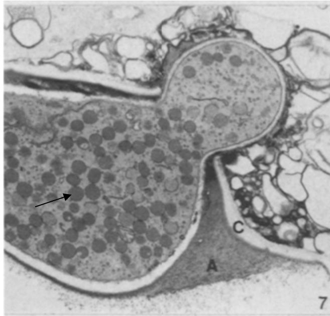
Figure 2. Electron micrograph of a thin section of Arthrotrrys oligospora demonstrating the presence of electron-dense microbodies (arrow) in the penetration hyphae, shortly after penetration of the nematode cuticle. (4h after capture; 10,000 x ), 7; this is micrograph number 7 in a series originally published in Veenhuis et al. , (1985). A, adhesive coating; C, cuticle of the nematode.

the studies of M. haptotylum in this thesis can also apply to other species of nematode-trapping fungi.