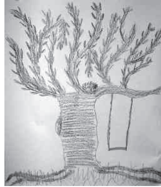
Figure 3. Maria's new “future tree”, three years later.

At the next session Maria painted a tree symbolizing the future (Figure 3). It was a brown broad leafed tree, like an oak, with long and powerful roots. The trunk was stable with some knots and there were many branches with leaves of different colours. There were also two broken branches and some leaves in yellow and brown. In the crown there was a bird's nest and on one stable branch hung a swing.