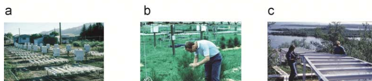
Fig. 2 Types of vegetation examined in the meta-analysis. The numbers refer to studies for individual species. Photographs of three different systems are also shown (a. wheat and wild oat experiments in Logan, Utah, USA, W. Beyschlag; b. Loblolly pine in Maryland, USA, A. Teramura; c. Subarctic heath in Sweden, from ref. 5).

were conducted in glasshouse or growth-cabinet conditions, the effects of the added UV-B radiation were greatly exaggerated. Thus, over 20 years ago investigators began to conduct such experiments outdoors using special UV lamp systems. There are now well over 100 such studies on different species of plants. Meta-analysis is a technique to use quantitative and statistical information provided in a collection of individual studies in a combined analysis to assess how well the overall research predicts common trends and results. Of the ca. 100 studies reviewed, 62 provided enough quantitative information suitable for a meta-analysis 14 for several types of managed and unmanaged ecosystems (Fig. 2).