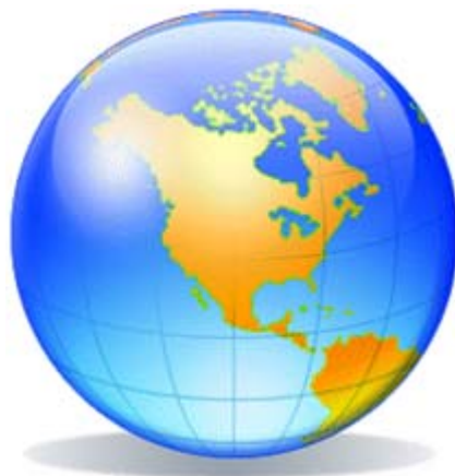
Figure 1: "The world"