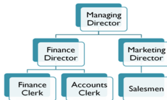
Figure 3: "The organization"

Organizations can often be seen represented in a format similar to Figure 3, where distinct functions and lines of authority/responsibility are delineated. However, when contemplating this, we immediately reflect that on the existence of both formal and informal organizational structures. It at once becomes clear that such a standardized model of "The Organization" does not reflect our individual and contextual experiences of organizational practice. It is a metaphor only for an organization as it is experienced.