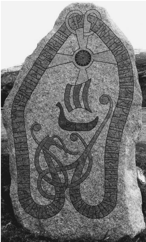
Fig. 4. Rune stone erected in northern Newfoundland in the year 2000 celebrating Leif Erikson's discovery of North America a thousand years ago.

May continued comfort prevail and peace on earth. Kalle carved."