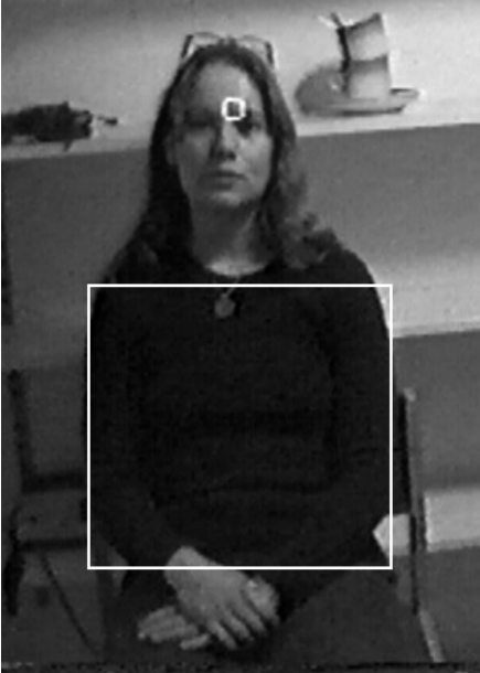
Figure 1. The speaker's central gesture space as a rectangle. Everything outside the rectangle represents the speaker's peripheral gesture space. The addressee's fixation as a white circle at its default location in interaction.