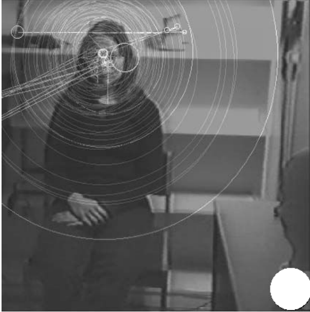
Figure 4. The saccades, fixation locations, and fixation durations of an addressee looking at a speaker. The diameter of the circles indicates the duration of the fixation. The fixation comparison point in the bottom right corner equals one second.