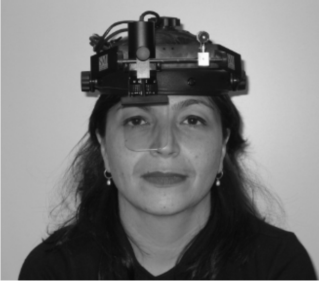
Figure. 3. The head-mounted SMI iView© eye-tracker.