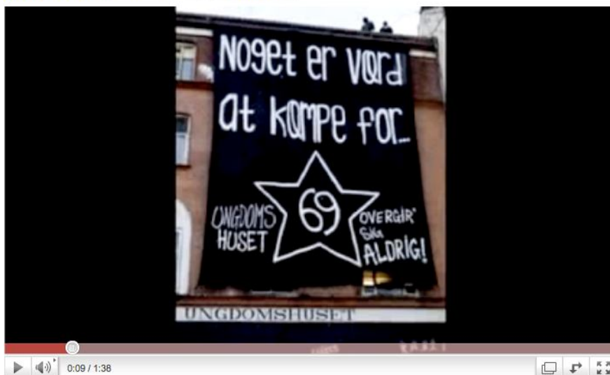
Fig 1. Opening image from the video 'Ungeren Blir': The text reads "Some things are worth fighting for. The Youth House '69' We will never surrender."

However, the myriad voices on YouTube are not in unison as these videos paying homage to the movement are juxtaposed on the very same platform with videos condemning the activists and their cause. The video 'Nej til Ungdomshuset' (No Youth House), draws upon the same kind of imagery as the videos supporting the event. The music used is from a German Neo-Nazi hard rock group vowing to fight for the Fatherland against intruders, and it is difficult to know whether the intent of the sender is to picture the movement as fascist in a pejorative way or if the sender is him- or herself a fascist. This kind of dissonance where seemingly conflictual material appears side by side and is specifically characteristic of YouTube demonstrating the multifaceted nature of such sites, a polyphony of mainstream, alternative, hegemonic and potentially subversive clips (Christensen, 2008: 156).