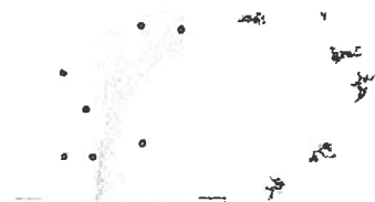
Figure 1 Gold nanoparticles generated by high temperature evaporation condensation (HT). To the left sintered 60 nm nanoparticles and to the right 60 nm diameter agglomerates.

Awareness of health effects due to nanoparticle exposure has continuously increased over the last decade. The primary route of exposure is by air, as particles deposit in the respiratory tract. Due to the special properties of nanoparticles, such as a high surface area to mass/volume ratio, concern has been raised with regards to their potential effects in biological systems. In recent years the particles interaction with biomolecules has been acknowledged as crucial for the understanding of particle toxicity (Lynch, 2009). When biomolecules bind to the particle surface a dynamic protein/biomolecule corona is created (Cedervall, 2007). The protein corona is dependent on the surface chemical properties, the size and morphology of the particles. The protein corona is believed to be important for the biological effects of nanoparticles.