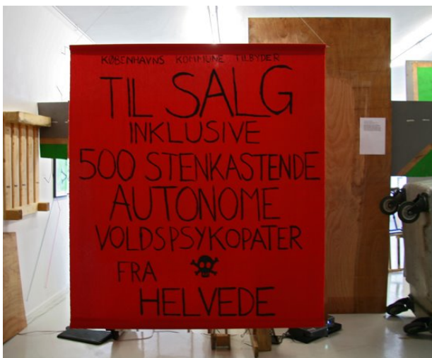
Fall 1999 (for sale including 500 violent psykopaths from hell) acrylic on banner 154x154cm 2008

Autumn 1999 – after a series of quarrels with the activists about a fire and the necessary restoration of Ungdomshuset, the city of Copenhagen decided to sell Jagtvej 69. The activists using the house would thereby be evicted. They on their