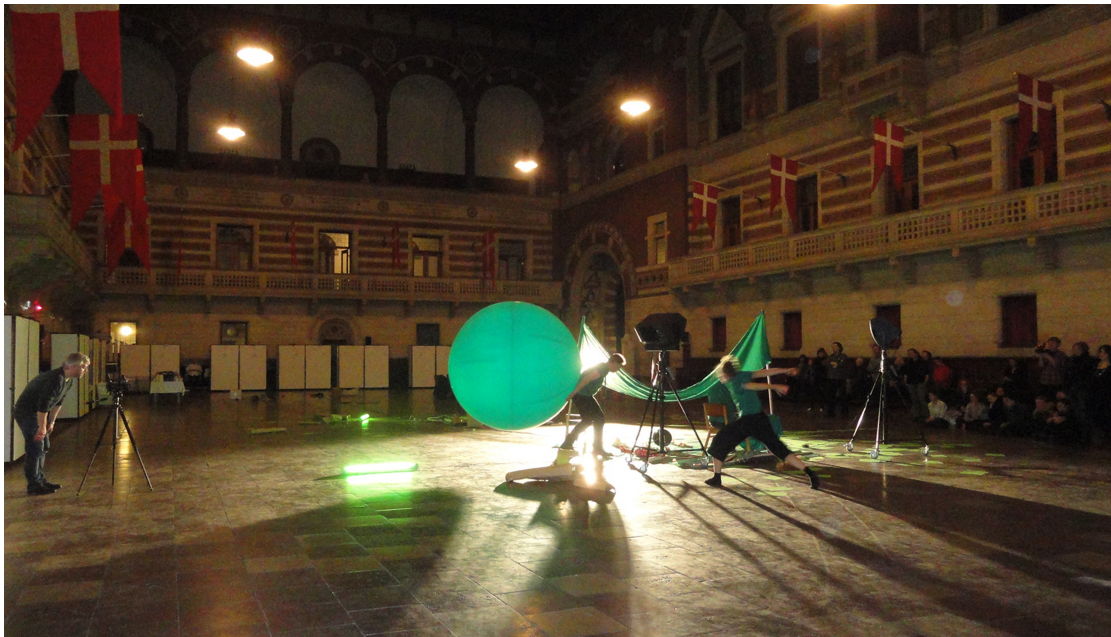
Copenhagen City Hall, Feb. 29th, 2012