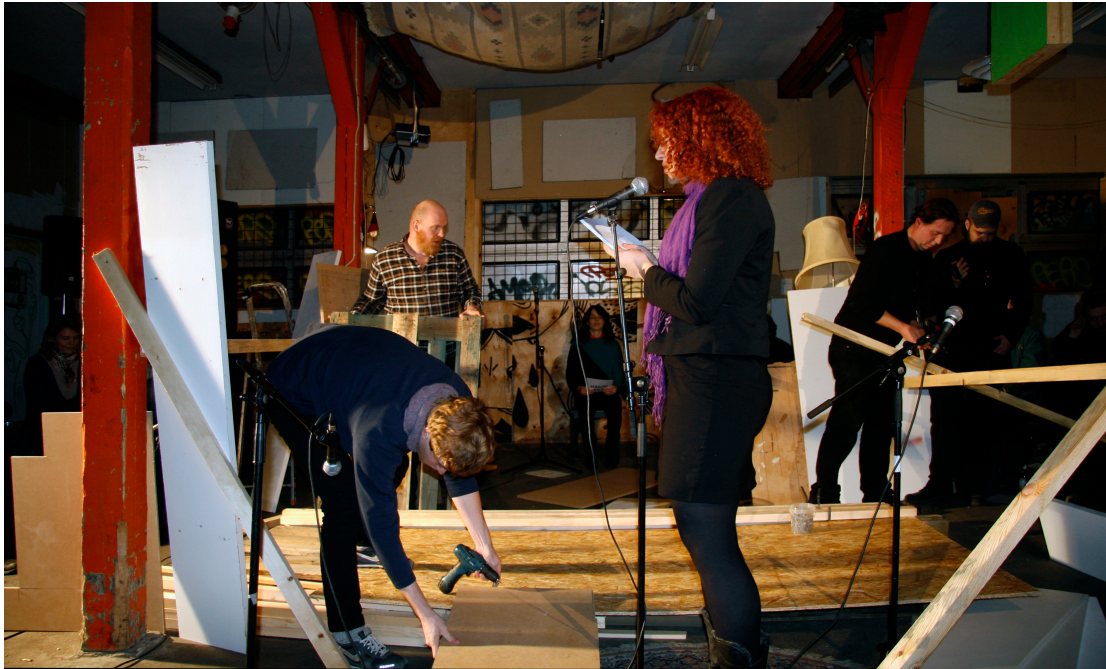
Mayhem, Copenhagen. January 17th, 2012