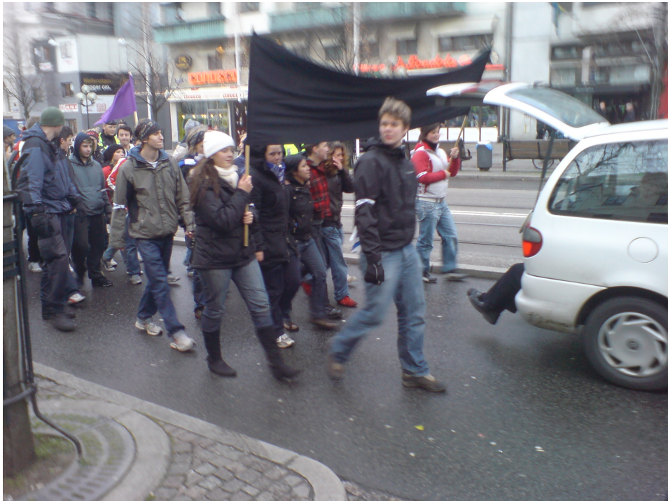
Gothenburg, November 23rd 2006