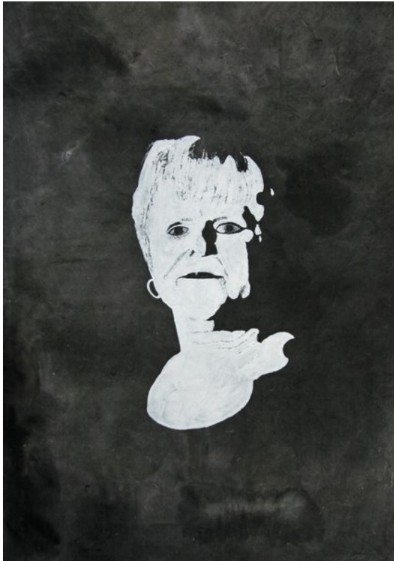
September 2001 The Father House ink and acrylic on paper 53x76cm 2008