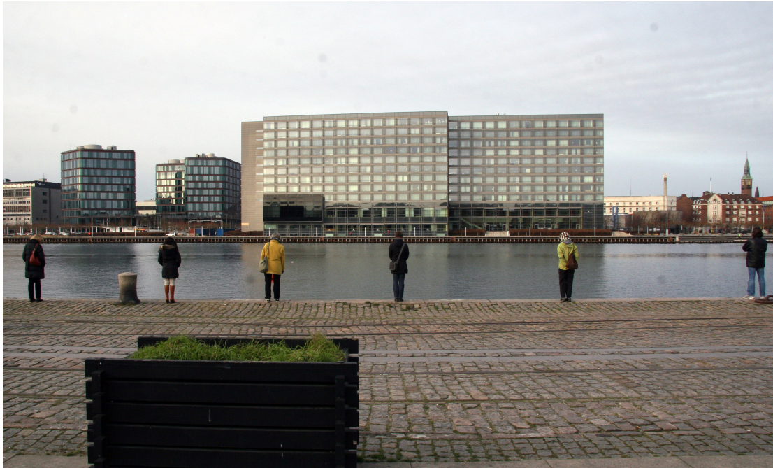
Kulturhuset Islands Brygge, Copenhagen, January 15 th , 2012