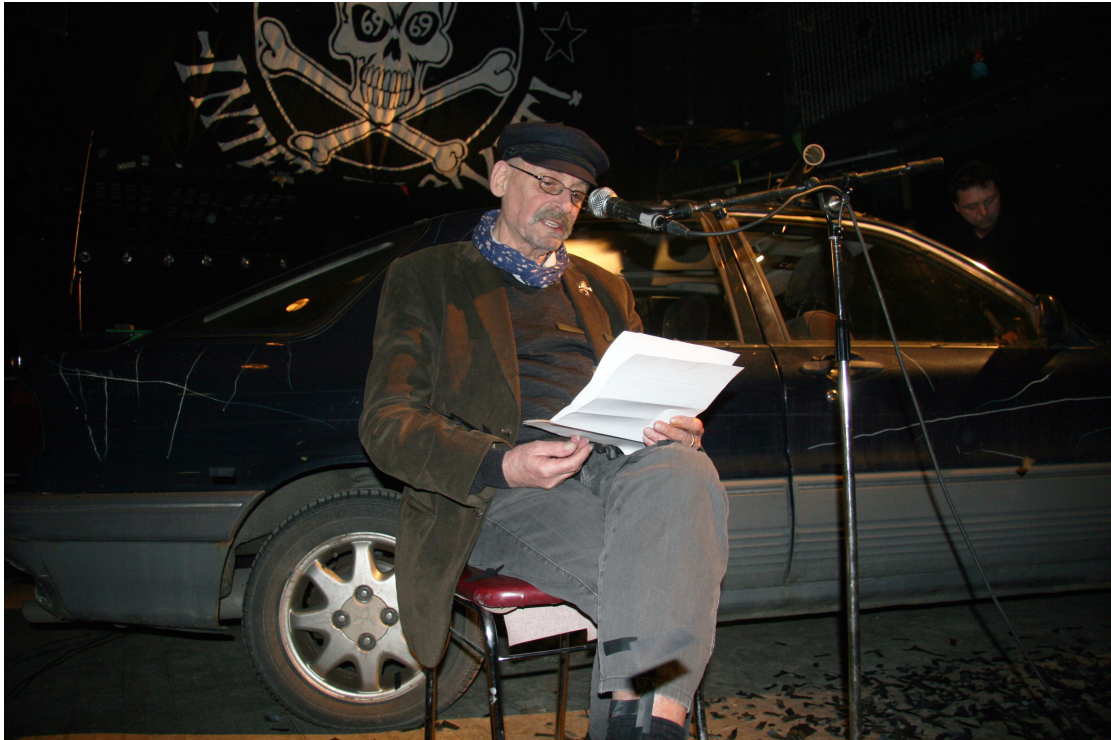
The New Youth House, Dortheavej 61, Copenhagen, February 24 th

3.1.2. Script 3.1.2. Performance: Ungdomshuset / The New Youth House Dortheavej 61, Copenhagen February 24 th at 20:00