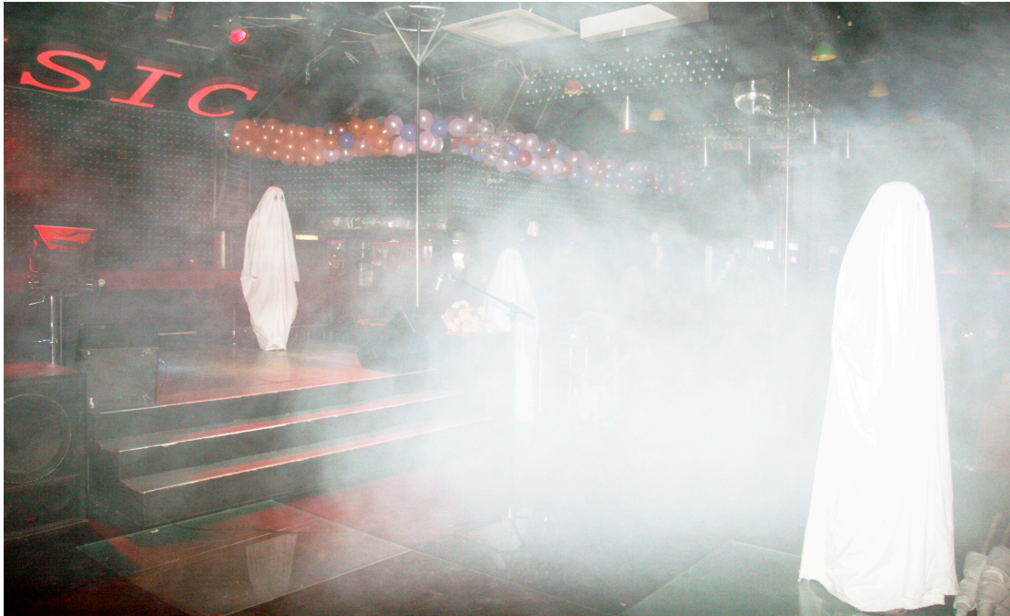
Blue Sky Karaoke Club (RO JI GAO LAN TIAN CLUB), Beijing 12.9.2009