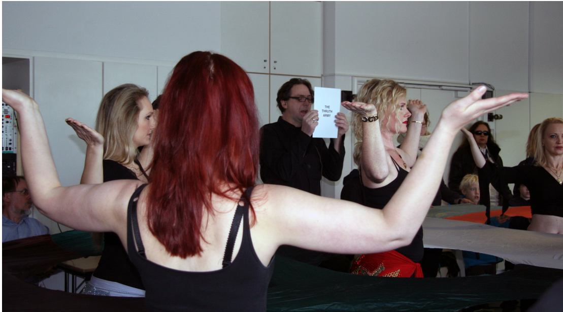
Kulturhuset Islands Brygge, Copenhagen, January 15 th , 2012