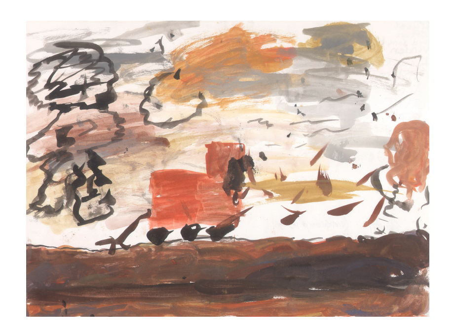
(b) "One crying and one dancing girl who are formed in the fog", imaginary motif, highly creative, belonging to category one.