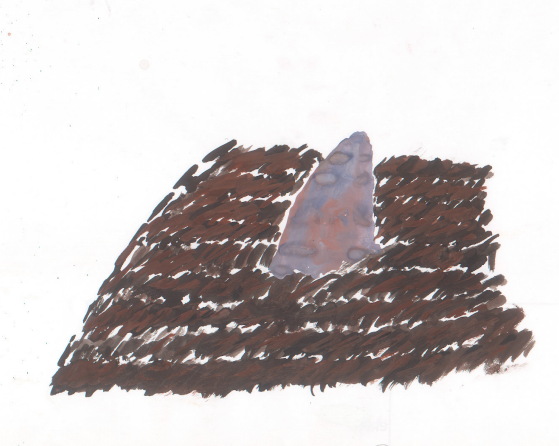
(b) "A kind of huge imaginary thing", imaginary motif, highly creative, belonging to category one.