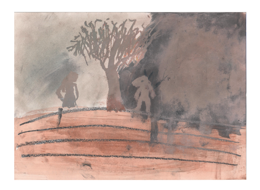
(a) "The devil and God meet in the fog", imaginary motif, highly creative, belonging to category one.