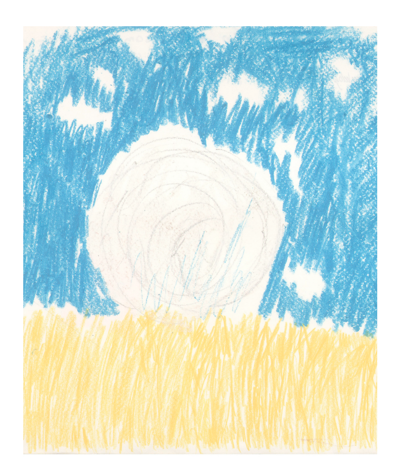
(a) "A good whirl", real-life motif, highly creative, belonging to category one.