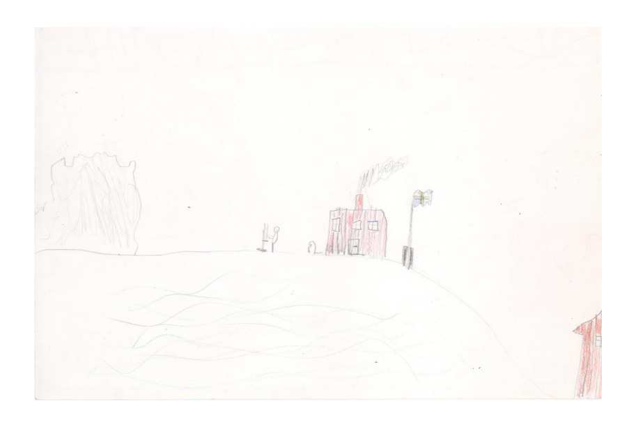
(a) "A cloud with something moving inside it", real-life motif, highly creative, belonging to category two.