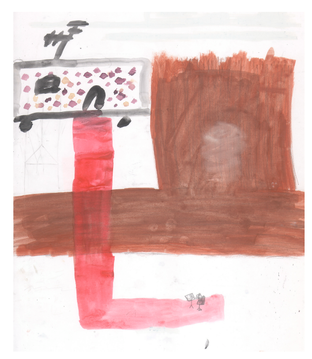
(b) "Whirlwind", real-life motif, less creative, belonging to category four.