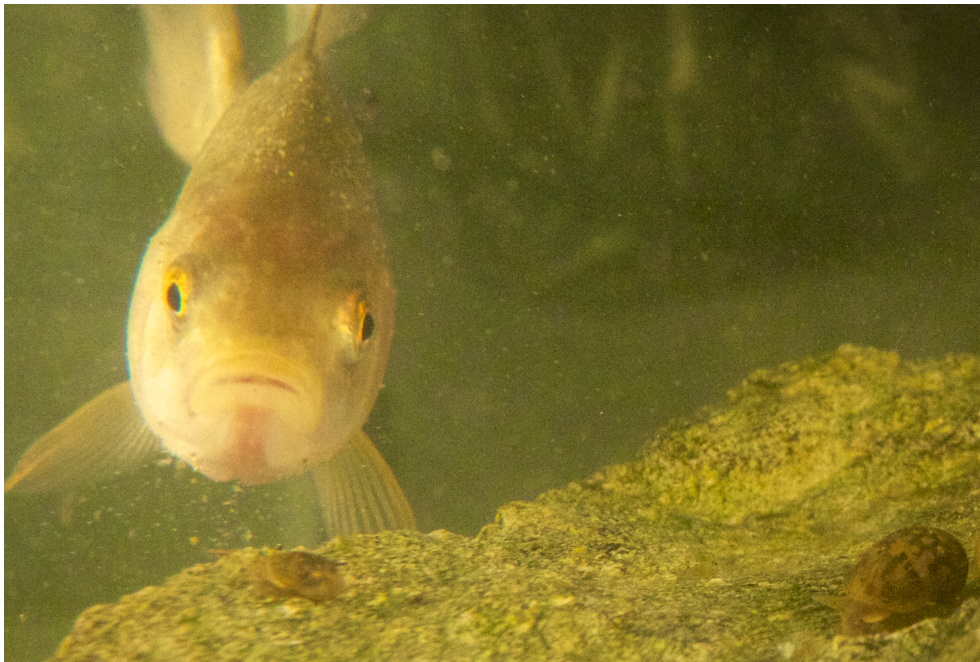
Fig. 2. The crucian carp Carassius carassius is common in ponds and a notorious predator on snails and gammarids. This predatory fish was used in papers I-IV .

Predators may differ in their hunting strategies as well as in their choice of habitat, therefore prey must adjust their defence to the each predator and not use a general response towards all predators (Beckerman et al. 2010). Many different prey species have been found to be able to recognise various predators and to adjust their defence accordingly (McIntosh and Peckarsky 1999, Laurila 2000, Gunzburger and Travis 2005, Petrin et al. 2010). Freshwater snails are under threat from a wide variety of predators like waterfowl, fish and different invertebrate predators and have been found to induce predator specific defences. The behavioural defences found in freshwater snails range from hiding behaviours (Dewitt et al. 1999, Rundle and Brönmark 2001), shell shaking (Townsend and McCarthy 1980) to crawl-out behaviours (Alexander