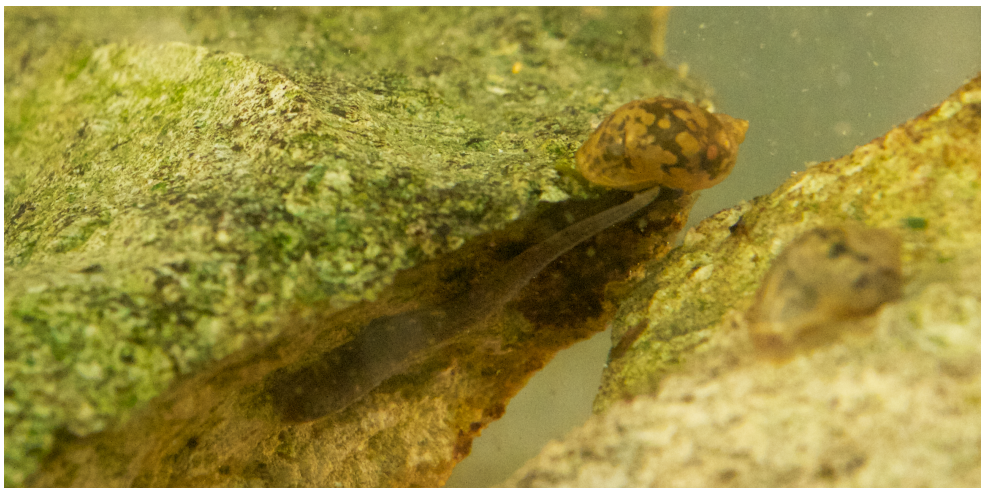
Fig. 3. The molluscivorous leech Glossiphonia complanata is common in ponds and lakes in southern Sweden. They have been found to be efficient sit-and-wait hunters, luring in refuges like rocks and macrophytes. This predator was used in papers III and IV .