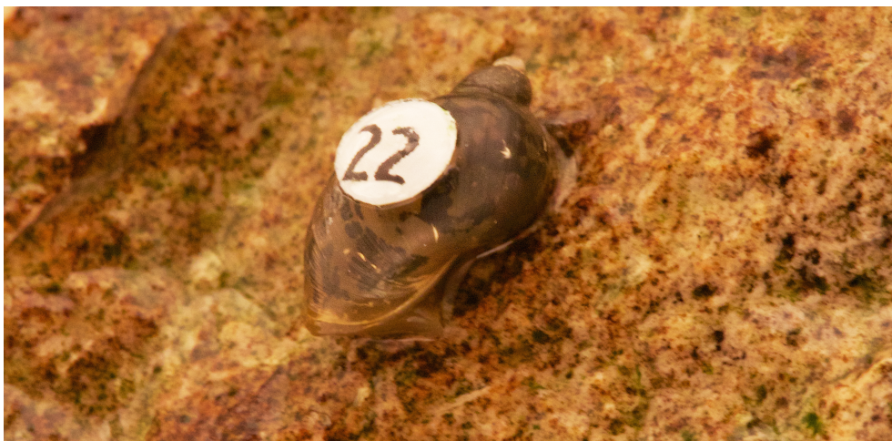
Fig. 5. Snails that were assessed for boldness in papers IV and V were individually tagged with numbered bee tags.