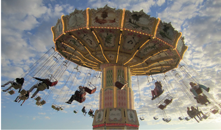
Figure 2. The wave swinger ride, found in many amusement parks, provides a striking example of the equivalence principle: note how empty and loaded swings form the same angle to the vertical. (The wave swinger in the photograph is found in Gröna Lund, Stockholm.)

basis for the design of the investigations and also for the formulation of the results, giving them a feeling of ownership [12]. However, it is also clear that the teacher plays a crucial role in the scaffolding of the students during the different parts of the investigations and discussions. The scaffolding concerned scientific descriptions of the phenomenon, but was also essential for developing tools for reasoning, argumentation and reaching agreements concerning questions in natural science.