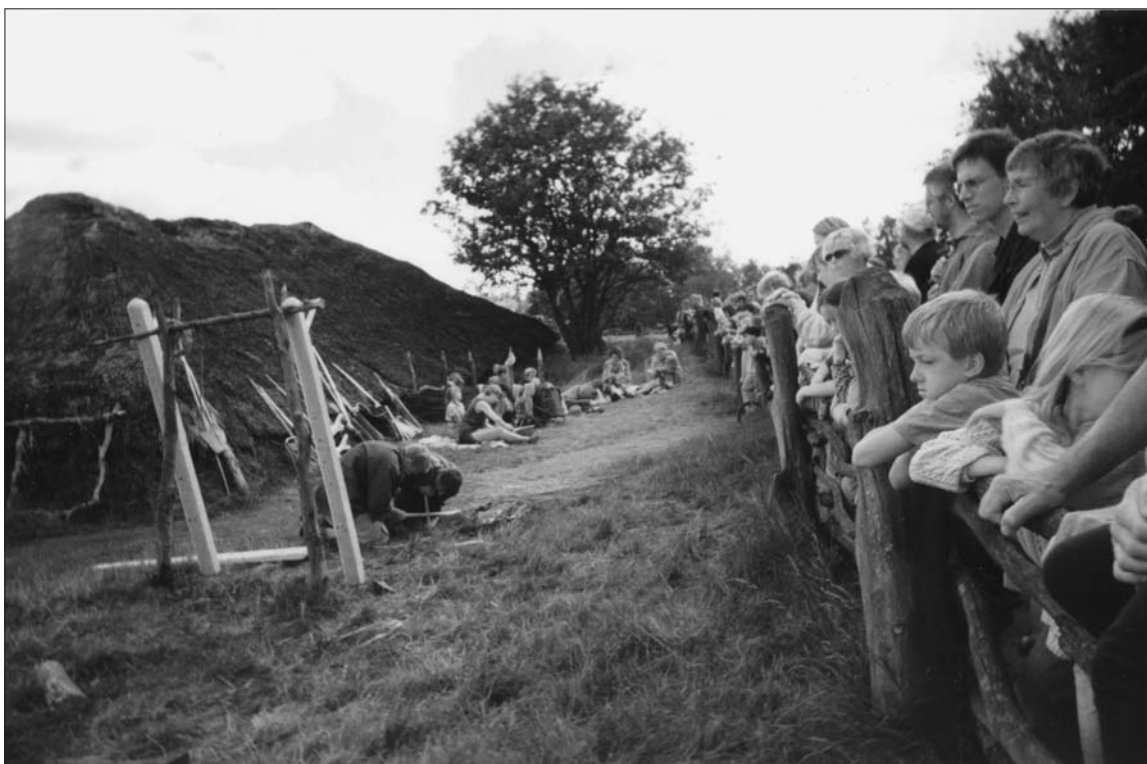
FIGURE 1. The Stone Age settlement and its visitors at Hjerl Hede Open Air Museum.