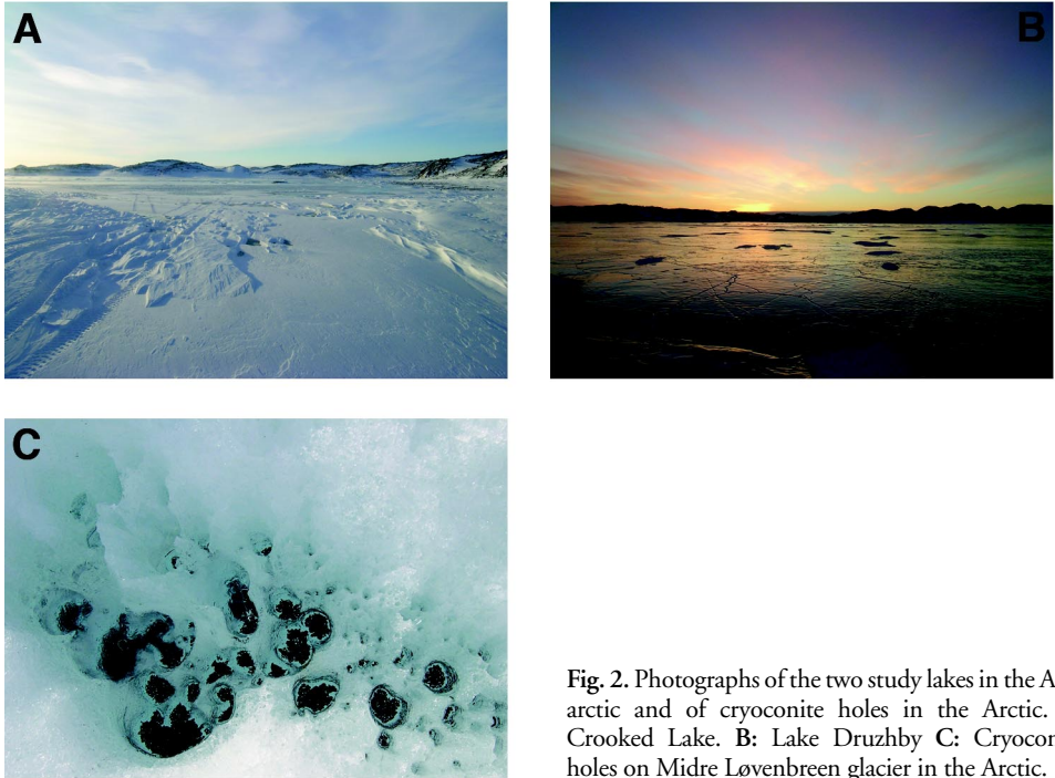
Fig. 2. Photographs of the two study lakes in the Antarctic and of cryoconite holes in the Arctic. A: Crooked Lake. B: Lake Druzhby C: Cryoconite holes on Midre Løvenbreen glacier in the Arctic.

the frequency of visibly infected bacterial cells (FVIB) and burst sizes [3, 13, 19, 20, 21, 26, 50, 52, 59]. In temperate freshwaters FVIB ranges between 0.6 to 5% with an average of 26 phages per cell [3, 13, 19, 20, 21, 26, 50, 52, 59]. Virus particles within the host cell become visible with TEM only towards the end of the latent period, thus the total fraction of infected bacterial cells (FIB) will be much greater than the number of visibly infected bacterial cells viewed under the microscope. Correction factors to convert FVIB to FIB vary and require estimates of what portion of the latent period cells are visibly infected [4, 57]. As mentioned earlier, the length of the latent period can vary but is often assumed to be equal to the bacterial generation time [36]. Results from Paper III indicate that virus-bacteria interactions in polar regions differ significantly from those in temperate regions, as the study reveals the highest FVIB (range 8.1% to 66.7%) and the lowest burst sizes (average 4) ever reported in the literature. Long generation times in the polar bacterioplankton, in particularly in the Antarctic ul-