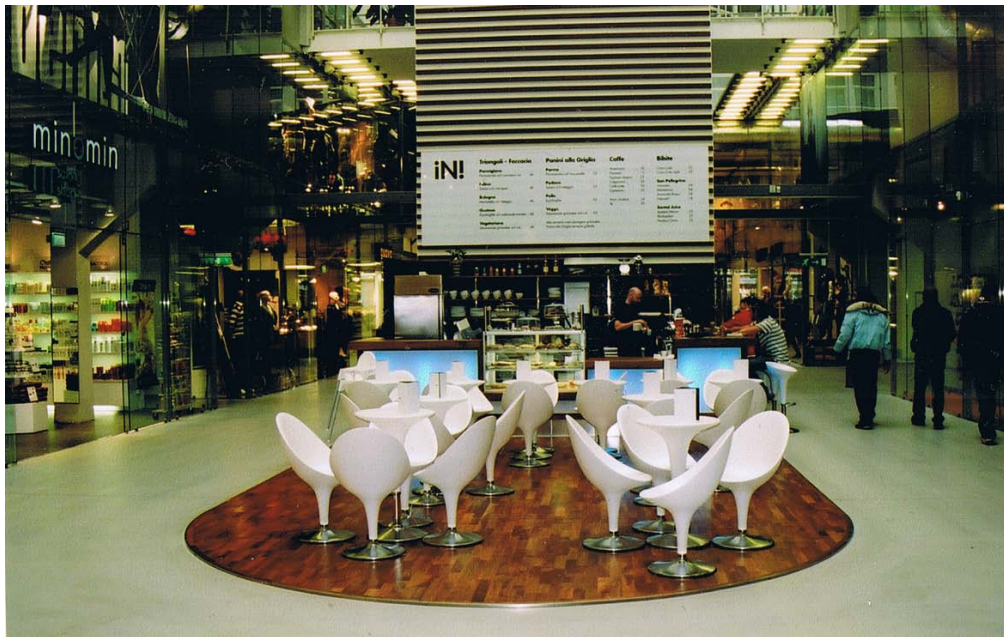
Fig 6. Indoor landscape of circulation and occupation at a new shopping mall, Malmö pedestrian precinct.