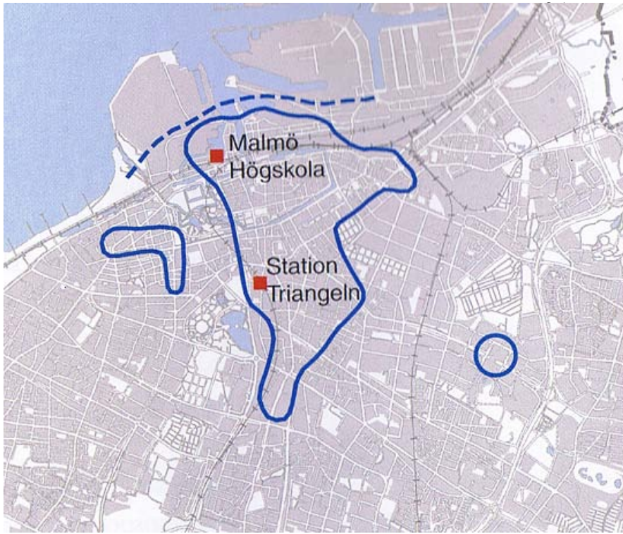
Fig 3. Areas where pedestrians will be given priority in Malmö planning (from Malmö Comprehensive Plan 2000)