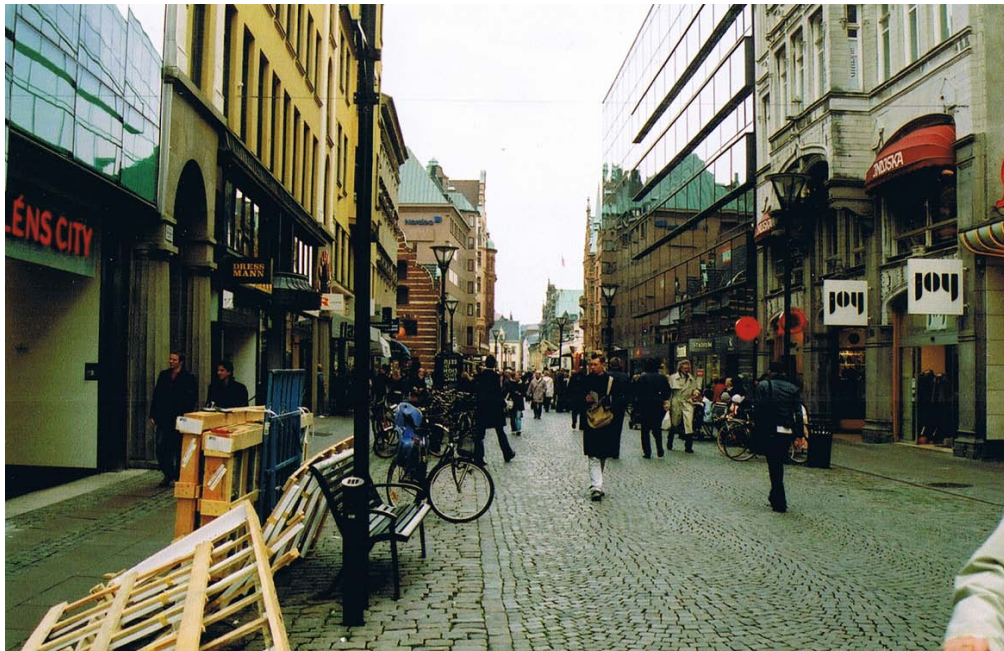
Fig 1. Malmö pedestrian street, early morning, November 2005.