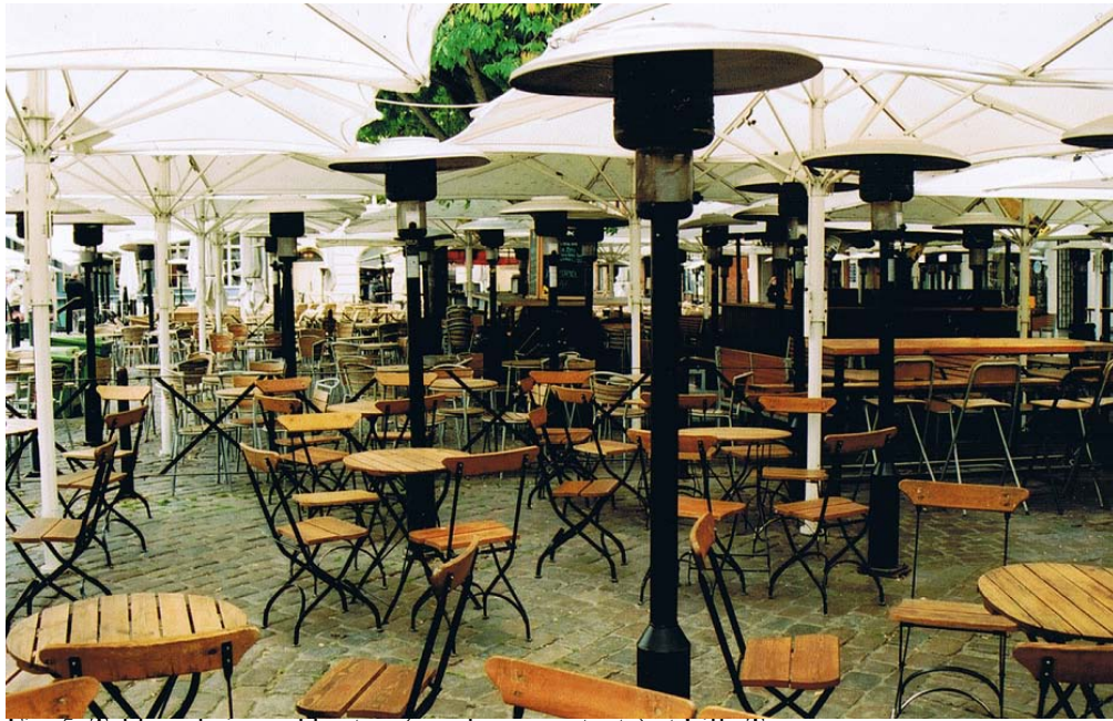
Fig. 5. Tables, chairs and heaters (non-human actants) at Lilla Torg