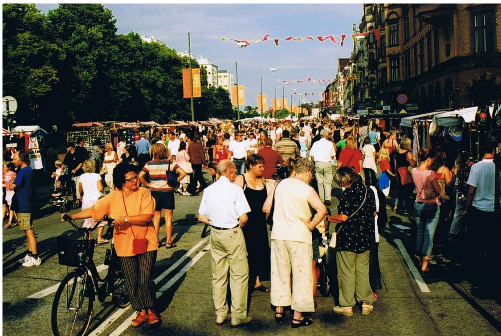
Fig 2. Temporarily pedestrianized street during Malmöfestivalen 2005