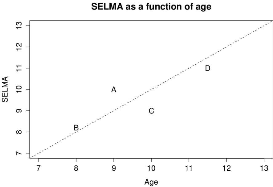
Figure 1. SELMA as a function of age for the example data given in Table 1. The dashed line indicates what a perfect relation between Age and SELMA would look like.