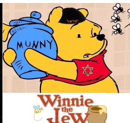
Fig. 4- “Winnie the Jew”.