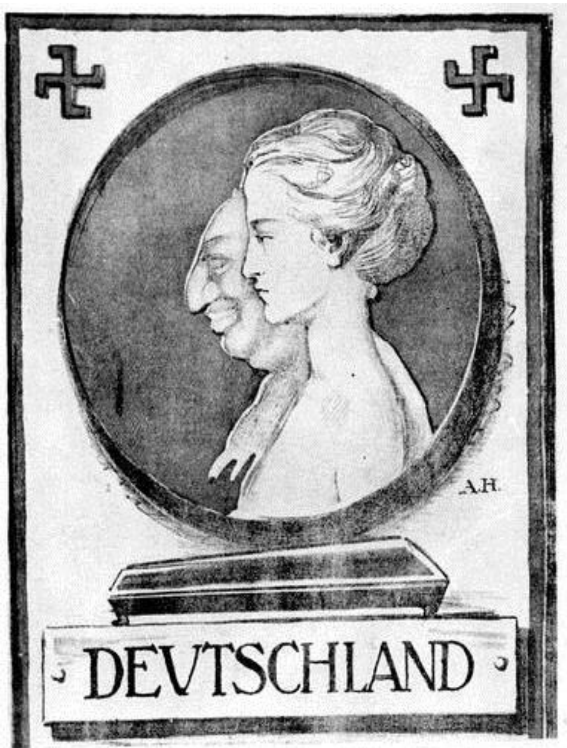
Antisemitisches Wahlplakat zur Reichstagswahl. 1920