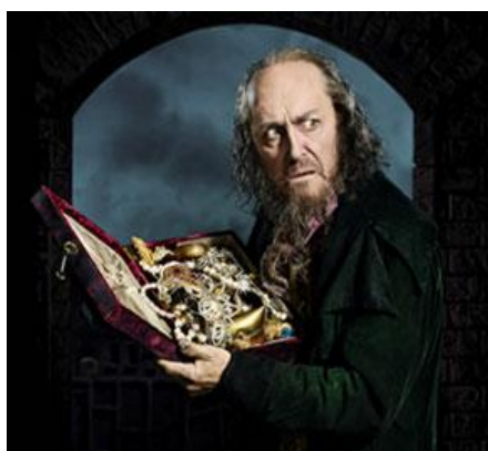
Fig. 3- Griff Rhys Jones as “Fagin”.