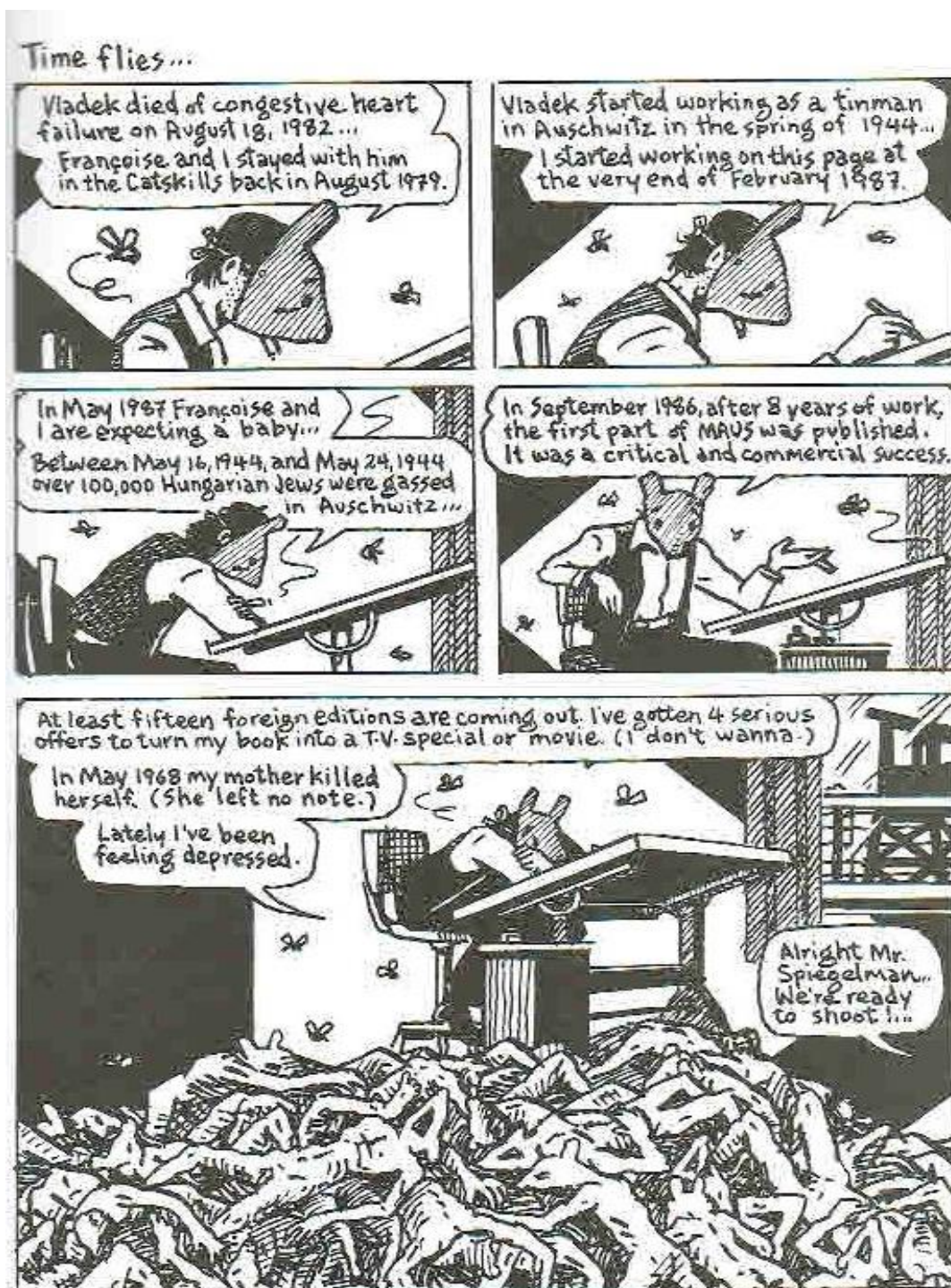
Fig. 6- Art at his drawing board perched on a pile of corpses. It shows the artists awareness and anguish about the success of his work, which is based on the story of the victims of the Holocaust. ( Maus 2:41).