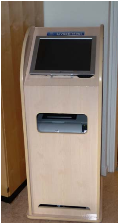
Figure 1. The e-SBI touch-screen IT-kiosk.