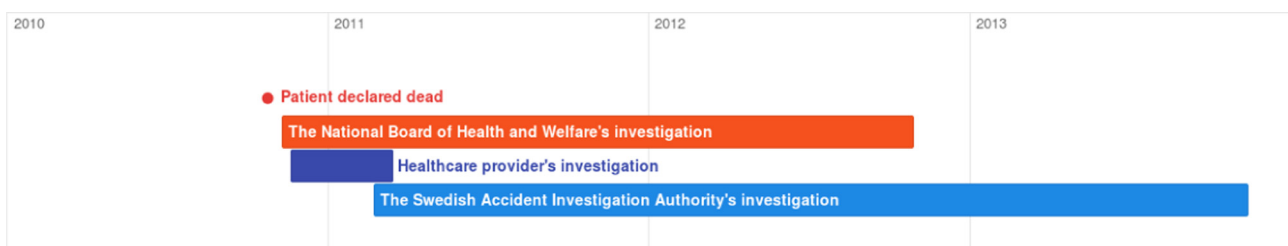
Fig. 1. Timeline showing the duration of the three investigations.

First, in order to identify the organisational level ('space') of the causal factor, we arranged codes according to a micro-meso-macro perspective (Cedergren and Petersen, 2011; Wrigstad et al., 2014, 2015). A causal factor at a micro organisational level is a factor identified within the department where the adverse event occurred, for example a local procedure, technical skills or staff issues. A causal factor at a meso organisational level is a factor that is identified outside the department where the adverse event occurred, for example the collaboration with another department or hospital management. A causal factor at a macro organisational level is a factor identified outside the organisation, for example the collaboration with another healthcare provider, authorities, politics or pharmaceutical companies. Second, to identify and code the distance in 'time' from the adverse event to a causal factor described in the incident investigations, we arranged a timeline (see Fig. 3) where "far" was the code for causal factors identified before admittance to the hospital, "close" was the code for causal factors identified from the admittance to the hospital until departure from the TICU and "very close" was the code for causal factors