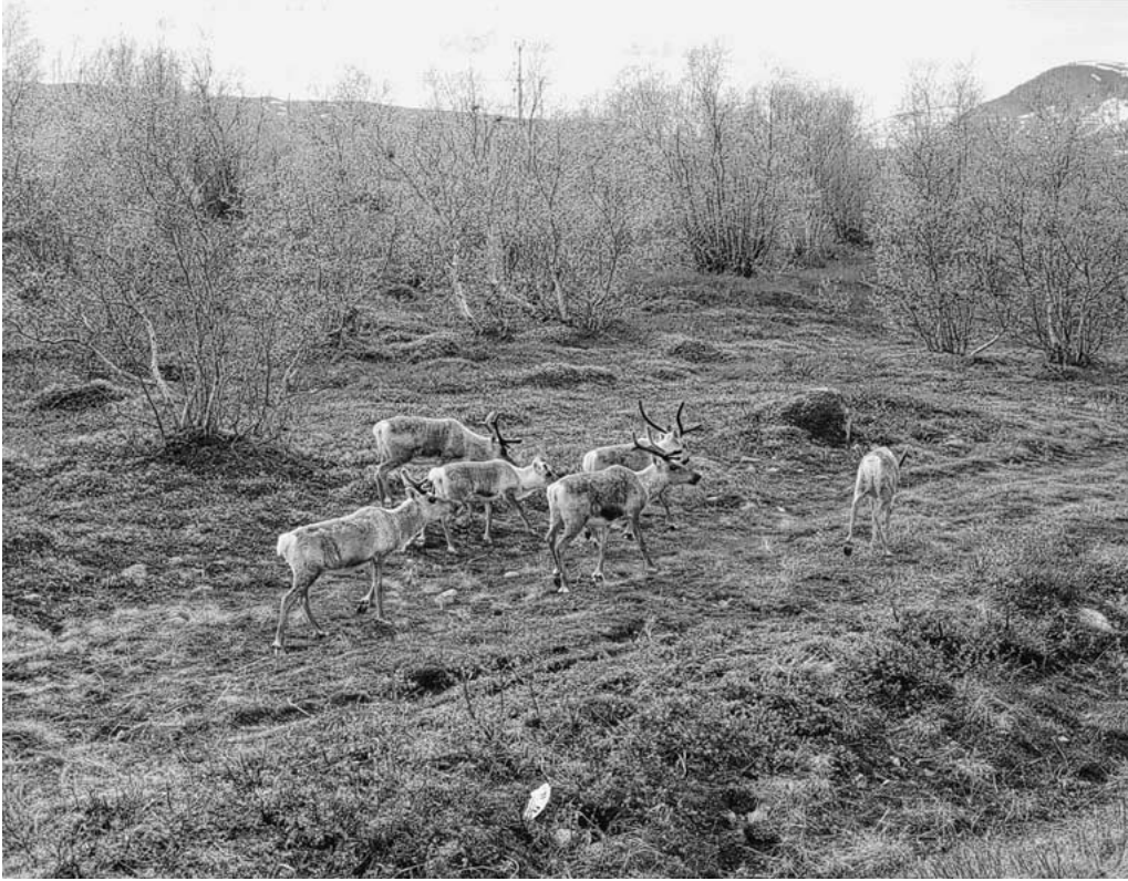
Mammals need vitamin D for several processes. Because of low levels of ultraviolet-B radiation in the Arctic, vitamin D could be in limiting supply for terrestrial mammals there, such as these reindeer. But what could be the role of vitamin D in plants, algae, and lichens, and how could it be affected by the UV-B level?