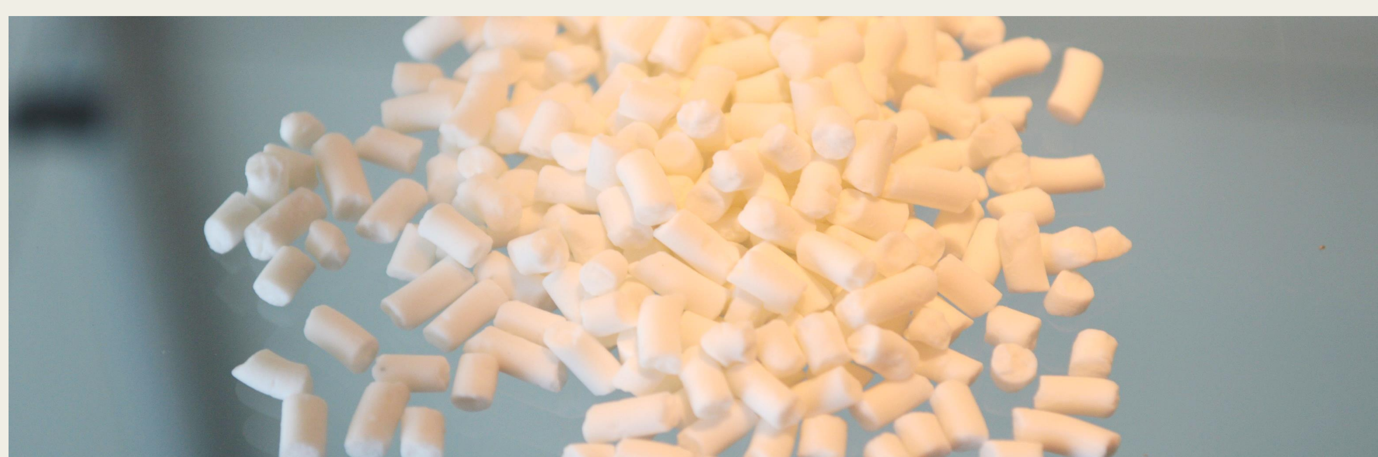
Figure 1. The alumina starting material.

The starting point for the experimental work is a commercial delta-phase alumina extrudate provided by Sasol GmbH. The extrudate has a diameter of 3.15 mm and is 3-9 mm long. The surface area as measured by nitrogen adsorption is 120 m 2 /g, the pore radius is about 12 nm and the pore volume 0.72 ml/g. The material was dried in a hot air oven for 12 h at 120 °C. There after the material was sintered in air at 1,100 °C for 4 hours in a muffle furnace. In addition, the virgin material was sintered at 750, 800 and 1,000 °C for comparison. The resulting materials were analyzed using powder x-ray diffraction and the resulting alumina crystal structure verified.