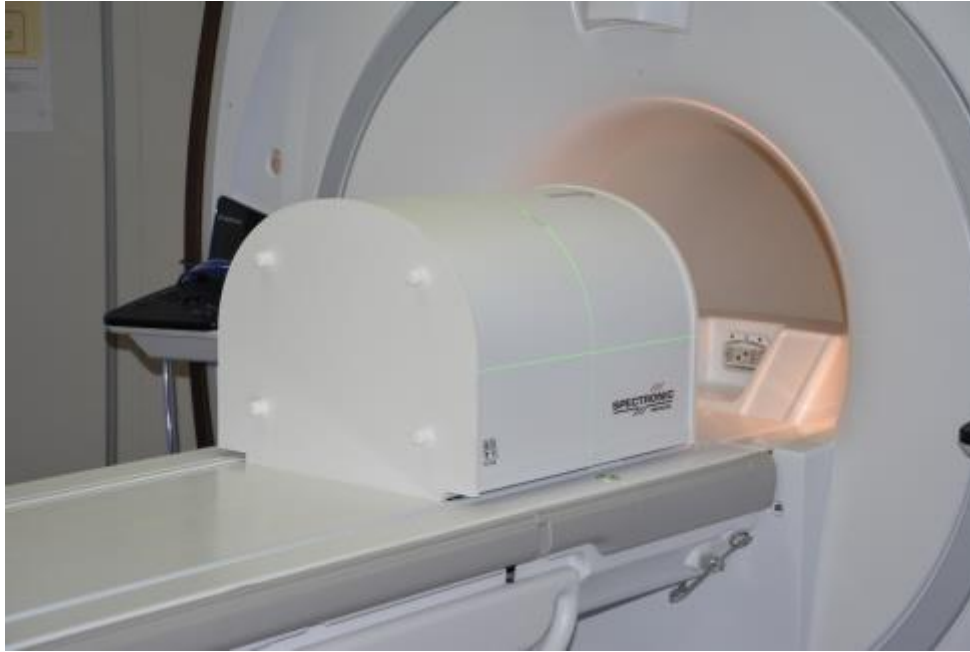
Figure 1. The commercially available phantom from Spectronic Medical AB is designed to assess geometric accuracy. It was placed on the MRI table without table top. Lines on the phantom surface was used to align the phantom using the built in laser positioning system on the MRI.

For accurate and comparable mapping of the geometric distortion, arising principally from system specific geometric distortion, it was of importance that an identical MRI sequence was used for the phantom and the in-vivo MRI only treatment planning study. The parameters used in the phantom MRI acquisition sequence were copied from the in-vivo MRI acquisition sequence used in an ongoing Swedish multi-center study (MR-Only Prostate External Radiotherapy, MR-OPERA). Due to the phantom size, the FOV and number of slices had to be adjusted. The in-vivo study was performed with MRI acquisition sequence parameters described in table 1. The acquisition sequence for the phantom was considered and referred to as the optimized acquisition sequence.