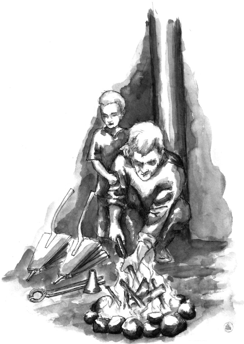
Fig. 4. Multimetalists at work. Drawing by Krister Kåm Tayanin/Gaia Arkeologi.

hearths dug directly into the ground with the aid of only rudimentary or temporary shelters (Svensson forthcoming).