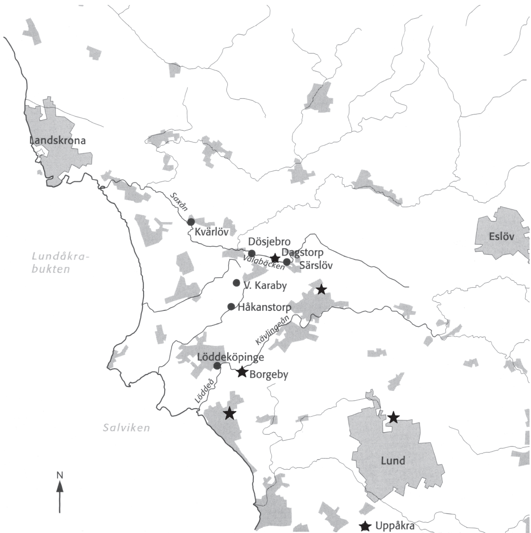
Fig. 3. Iron Age settlements with remains of forging and casting crafts in the Borgeby area. Multimetal sites indicated by stars (after Becker 2005, 281).

and complex metalworking is seen around Borgeby, western Scania. The presence of metalworking including handling of precious metals has been used as an indication of Borgeby's special economic status in the area during Late Iron Age and Early Middle Ages (Helgesson 2002, 74). The metalworking at Borgeby is clearly of a complex nature and of long continuity, as is shown by excavations