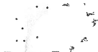
Figure 1 Gold nanoparticles generated by high temperature evaporation condensation (HT). To the left sintered 60 nm nanoparticles and to the right 60 nm diameter agglomerates.

Awareness of health effects due to nanoparticle exposure has continuously increased over the last decade. The primary route of exposure is by air, as particles deposit in the respiratory tract. Due to the special properties of nanoparticles, such as a high surface area to mass/volume ratio, concern has been raised with regards to their potential effects in biological systems. In recent years the particles interaction with biomolecules has been acknowledged as crucial for the understanding of particle toxicity (Lynch, 2009). When biomolecules bind to the particle surface a dynamic protein/biomolecule corona is created (Cedervall, 2007). The protein corona is dependent on the surface chemical properties, the size and morphology of the particles. The protein corona is believed to be important for the biological effects of nanoparticles.