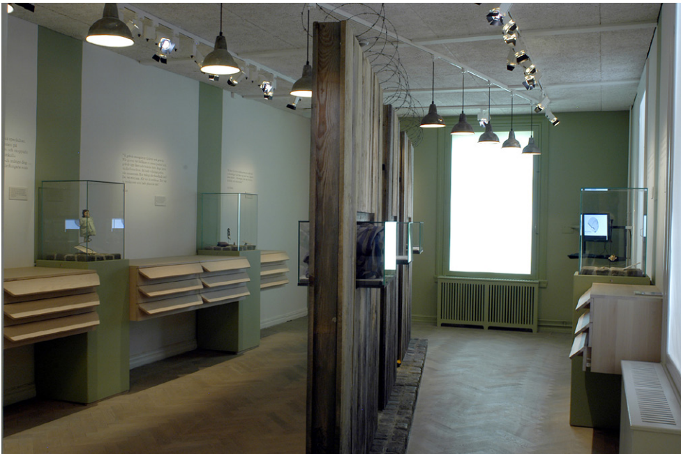
Image 2: The exhibition entitled To Survive – Voices from Ravensbrück.