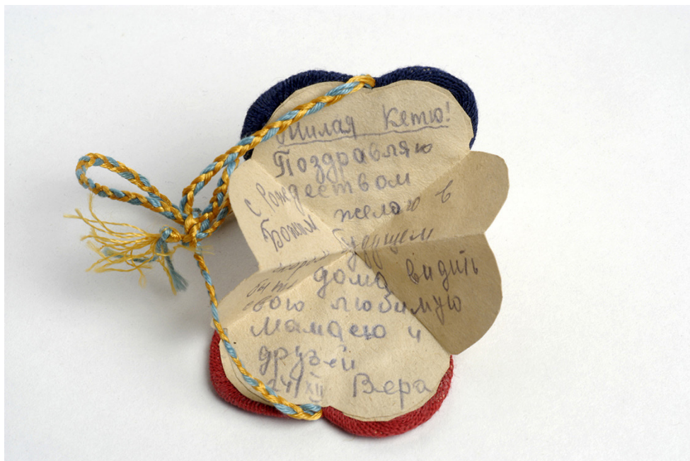
Image 1: Card made by a prisoner in Ravensbrück Concentration Camp, and shown in the exhibition entitled To Survive – Voices from Ravensbrück .

When, in 2004, Lakocinski's children decided to donate to Kulturen the collection of artifacts from Ravensbrück, which they had inherited in 1987 after the death of their father, it was on the condition that the museum would create an exhibition of the objects. 4 The permanent exhibition entitled To Survive – Voices from Ravensbrück opened on January the 27 th 2005 - 60 years after the end of World War II, and the year Lakocinski would have turned 100 years old. 5 It shows the entire collection of 200 objects, together with excerpts from interviews with survivors.