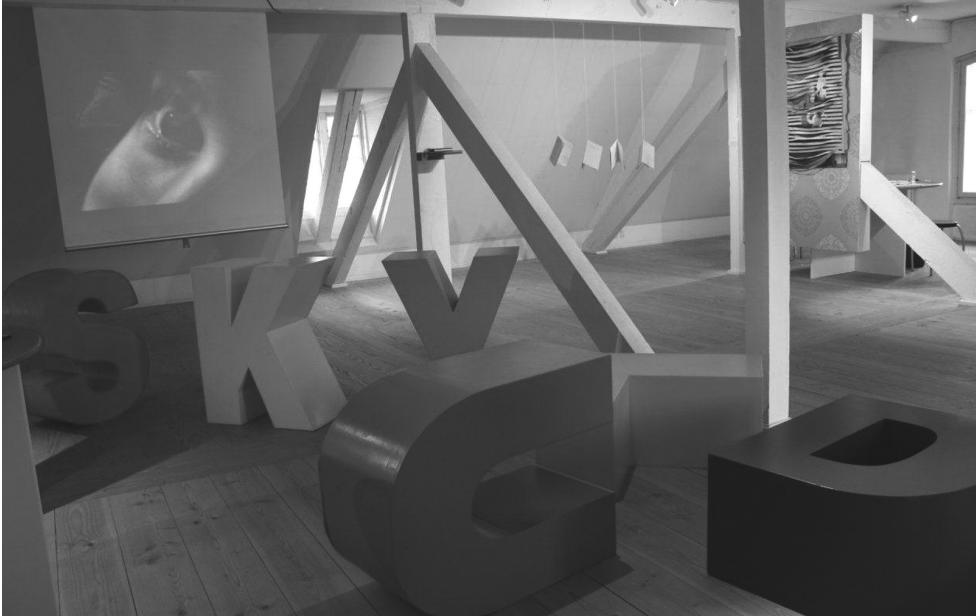
Fig. 1. Scenery from the exhibition entitled It's not Your Fault shown at The Women's Museum in Aarhus, Denmark 2010–11.

interest. The question of the social responsibility of museums has been raised, and attention has been paid to the ways museums communicate with their audience, how they work with inclusion, representation and participation, e.g. how some things are shown while others are left out, and how some people are invited, while others are marginalised (Sandell 2003, 2007, 2011, Janes 2007, 2009, Goodnow & Akman 2008, Marstine 2011 for example). Parallel to these discussions, it has been discussed whether and how museums can contribute to life-long learning (see for example Hein 1998, Hooper-Greenhill 2000, 2004). Lately, focus in the field of museology has been on the involvement of museums with hot or controversial topics of different kinds (Silvén &