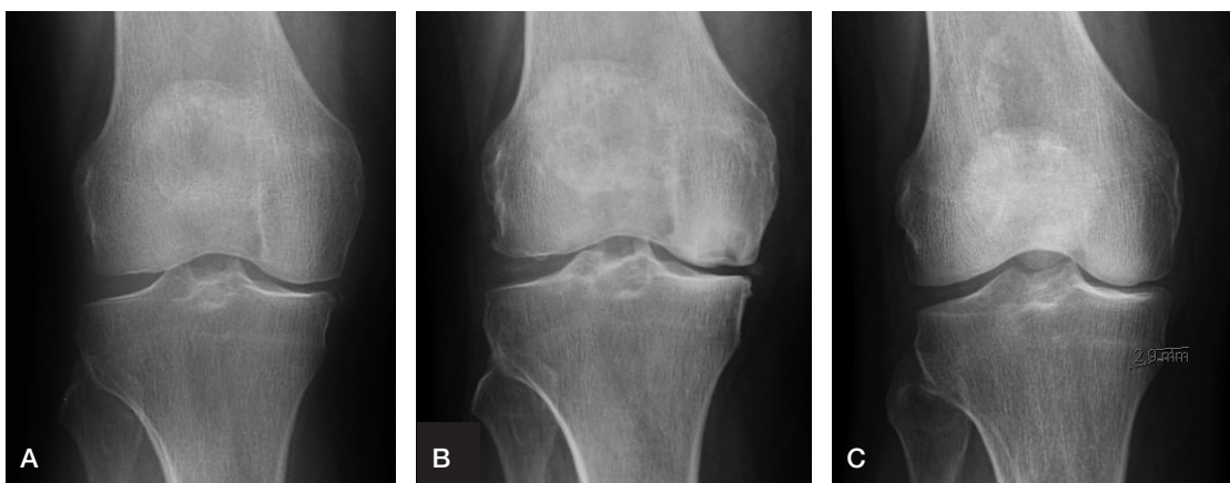
Figure 2. A. An 82-year-old woman suddenly noticed pain in her right knee. A mild osteoarthritis was seen and regarded as the cause of the symptoms. No treatment was given. (This radiograph was taken 1 month after start of symptoms). B. One year after start of symptoms, the symptoms were the same and a visible osteonecrosis was now seen with a Lotke index of 33%. The patient was referred to our department. C. The patient was treated for 13 months. Radiograph taken at follow-up 2 years after the start of treatment. The osteonecrosis had healed completely but the patient had developed mild osteoarthritis of Ahlbäck grade 1.

dyle. The duration of symptoms was 5 (1–15) months. The inclusion criteria were typical osteonecrotic changes on MRI scan and sudden onset of pain without significant preceding trauma. No time limit from debut of symptoms or diagnosis and start of treatment was used. The exclusion criteria were known bisphosphonate allergy, kidney or dental problems, known secondary etiology of osteonecrosis, and manifest osteoarthritis of Ahlbäck grade > 1 at onset of symptoms.