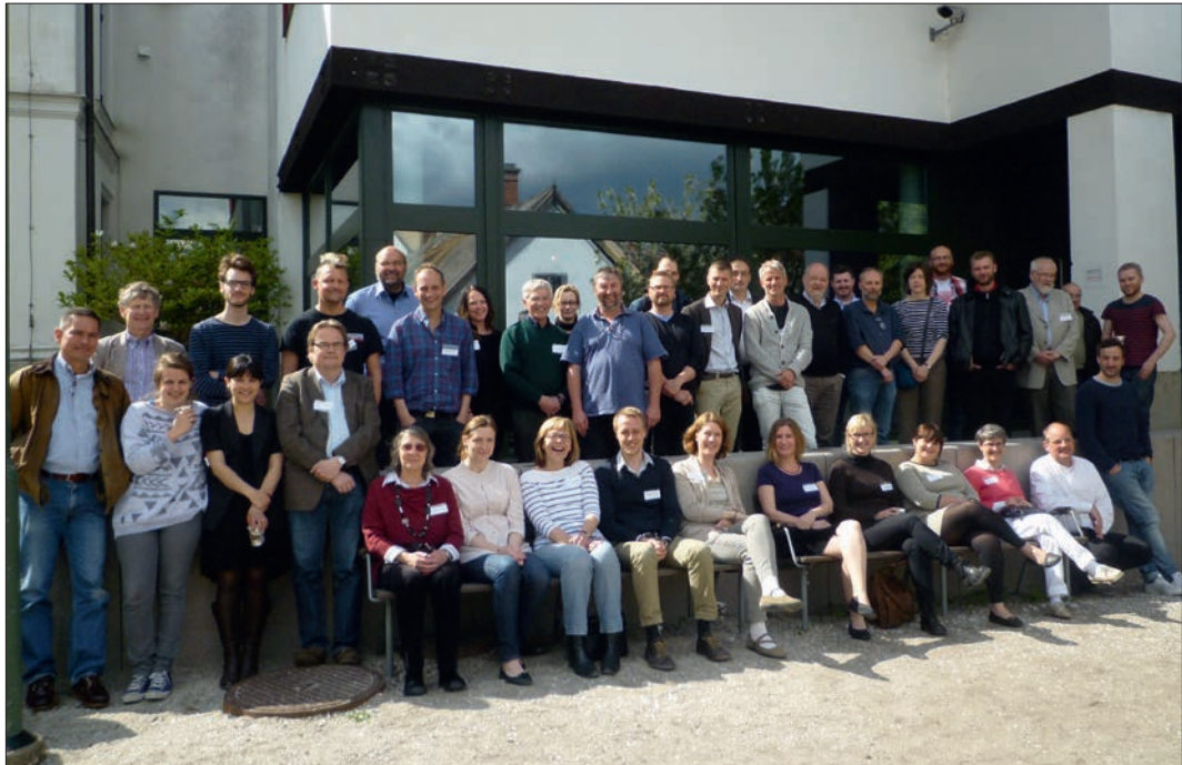
The members of the conference “What’s New in the Neolithic”, May 2013.