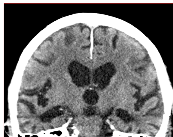
Fig. 1 Medial temporal lobe atrophy. Example of abnormal medial temporal lobe atrophy in a CT scan in a study patient representing a score of 3 on the left side and 4 on the right side. This was not mentioned in the original report. This patient had an MMSE score of 22 points with 0 points on the memory item. This patient had no previous mentioning of cognitive impairment in medical records

To obtain an estimate of intra-rater reliability, 30 CT scans were re-rated by the same rater, blinded to the previous rating, with 12 months between the ratings.