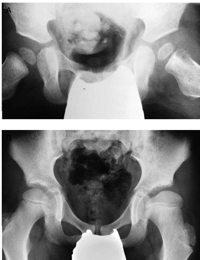
Figure 2 (case 10).