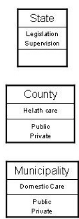
Figure 1 Levels of organisation and responsibilities in the Swedish health care system

The domestic care of elderly and disabled people is the responsibility of the municipalities, and the responsibility for the delivery of health services on all levels rests largely with the county councils. The county councils decide on the allocation of resources to the health services and are responsible for the overall planning of these services, even if the health institutions are run by private providers. (2003; Gross-Tebbe and Figueras 2004)