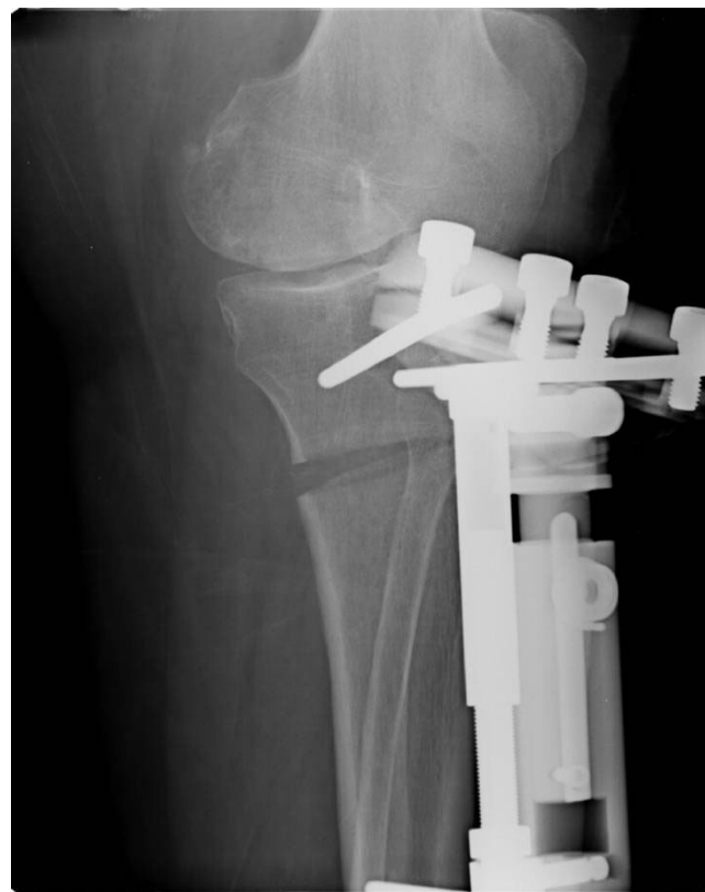
Figure 2 Radiograph of high tibial osteotomy using the hemicallotasis technique.

The association between preoperative knee alignment (HKA angle) and preoperative knee pain (KOOS subscale pain), and change in knee alignment with surgery (the difference between preoperative HKA angle and postoperative HKA angle) and change in knee pain over time was assessed by simple regression analyses. Multiple regres-