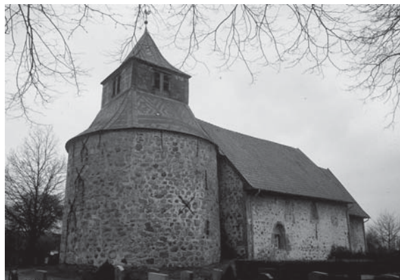
Fig. 4. The church of Översee, Southern Schleswig in Germany. Photo: J. Wienberg, April 1979.

Many, all too many medieval churches in Scandinavia have been interpreted as defensive churches. In this way all round churches in Scandinavia have been interpreted as fortified in an influential dissertation by