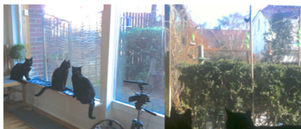
Figure 1. Recording set-up with bird food outside the window and video camera with shotgun microphone.

microphone) was positioned on a tripod next to a large window. A variety of bird food was arranged outside (apples and bird seeds on the ground, bird feeders containing peanuts and fat ball nets on strings and poles). When the cats were vocalising at birds through the window, recording could be started from an adjacent room using the remote control without disturbing the cats. Additional recordings were done with an Apple iPhone 3G. Figure 1 shows the set-up for the video camera with the shotgun microphone.