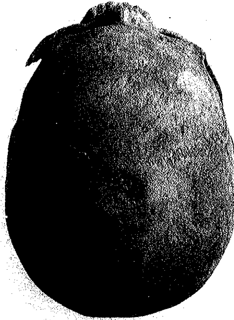
Fig 4. Trepanned skull from Kv. Clemens 9, Lund, Scania.

KV. CLEMENS 9, LUND, SCANIA. KM 71839, Grave 1551. The churchyard was investigated in 1982-84 and contains ca. 400 graves, dated to 1100-1200. Judging from the staining, the trepanned skeleton in the grave was lying in a cist with its arms straight and without any grave gifts (information provided orally by Thorvald Nilsson, Kulturen, Lund). The skeleton of a male aged 20-30 years had a circular trepanation hole measuring ca. 15 mm above the sagittal suture. The edges of the bone exhibit a vital reaction (information provided orally by C. Arcini). Medieval Period.