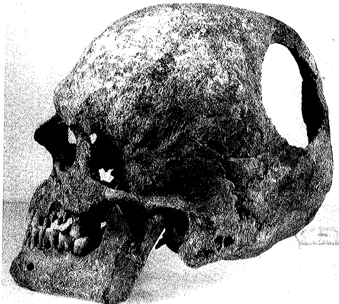
Fig. 3. Trepanned skull from Abbekås, Scania.

Iron Age to the Late Viking Period. The grave field has been investigated on a number of occasions from 1875 to 1981 in conjunction with sand and gravel extraction (Salin 1922; Nylén 1967; Orrling 1970; Östmark 1970; Petersson 1982; Lindquist 1988). The skeleton with the trepanned skull was lying beneath a shallow earth mound with an internal cairn. Three petroglyph fragments were found inside the cairn. A penannular brooch was found in the grave (Carlsson 1988), together with a bronze pin for the brooch, a fragmentary bronze buckle-loop with animal masks, a double folded bronze buckle plate, a