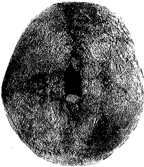
Fig. 2. Trepanation of the cranium from Gillhög, Scania.

mately 5 cm wide. The longitudinal axis of the ellipse coincides more or less with the median line of the parietal region. The anterior margin of the area is on the os frontale, approximately 2 cm from the bregma (this point is difficult to establish, since the sutures of the scraped area are completely obliterated). The posterior limit is located on the ossa parietalia, approximately 2 cm in front of lambda. The skullcup has been gradually tapered off towards the centre, and this procedure resulted in a 44 mm long and 16 mm wide opening in the centre itself" (Persson 1977). The male, who was aged between 40 and 50, had survived the operation, since the edges of the bone exhibit a vital reaction (Persson 1977). Neolithic.