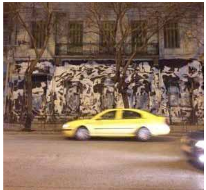
Figure 2 Black and white patterns in Patisson Street. Photography Tina Bitouni © in January 2018.

This paper draws methodologically on the researchers’ own empirical material. For our analysis, we use data from primary and secondary sources. This section describes our data gathering tools, which are: 1) photographic documentation of the field and 2) photographic data and articles from online web blogs, newspapers, free press magazines circulated online, as well as a number of academic literature articles. More specifically, the pictures were taken by the authors in two different periods: 1) in March 2015, when the artwork was released on the walls of the Polytechneio, and 2) almost three years after its erasure in the winter 2017/spring 2018, in order to compare the walls outside the Polytechneio presently. Based on fieldwork conducted in Athens in the winter 2017/spring 2018, the Polytechnic walls were fully covered by small tags or bigger pieces of graffiti, and not by a big-scale coherent entity of one piece as occurred in March 2015 (see Section 4). This is a confirmation based on the photographic testimony, which could lead us to consider the Polytechnic façades as legal or open graffiti walls (see Footnote 4). We then documented other artworks nearby which presumably could belong to the same graffiti crew. 5 These assumptions were driven by the similarities between the black and white patterns of the pieces (Figure 2, an instantiation from Patisson Street in central Athens).