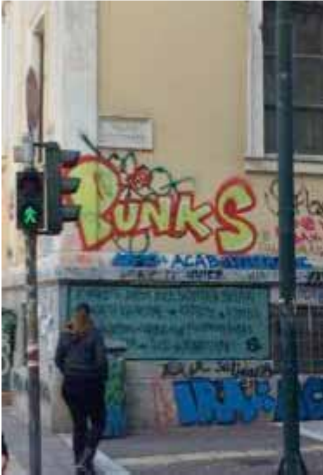
Figure 5 Polytechnieo at present. in December 2017.

This asserts for the state of oblivion that the building has suffered and that both opponents and supporters of the mural referred to. In this state of oblivion, “an object is no longer noticed, and its meaning is no longer present or important for the society” (Gamboni, 1997). But, this time, the black-and-white mural, as a conspicuous and ambiguous visual utterance and as an artistic defiance drew everyone’s attention.