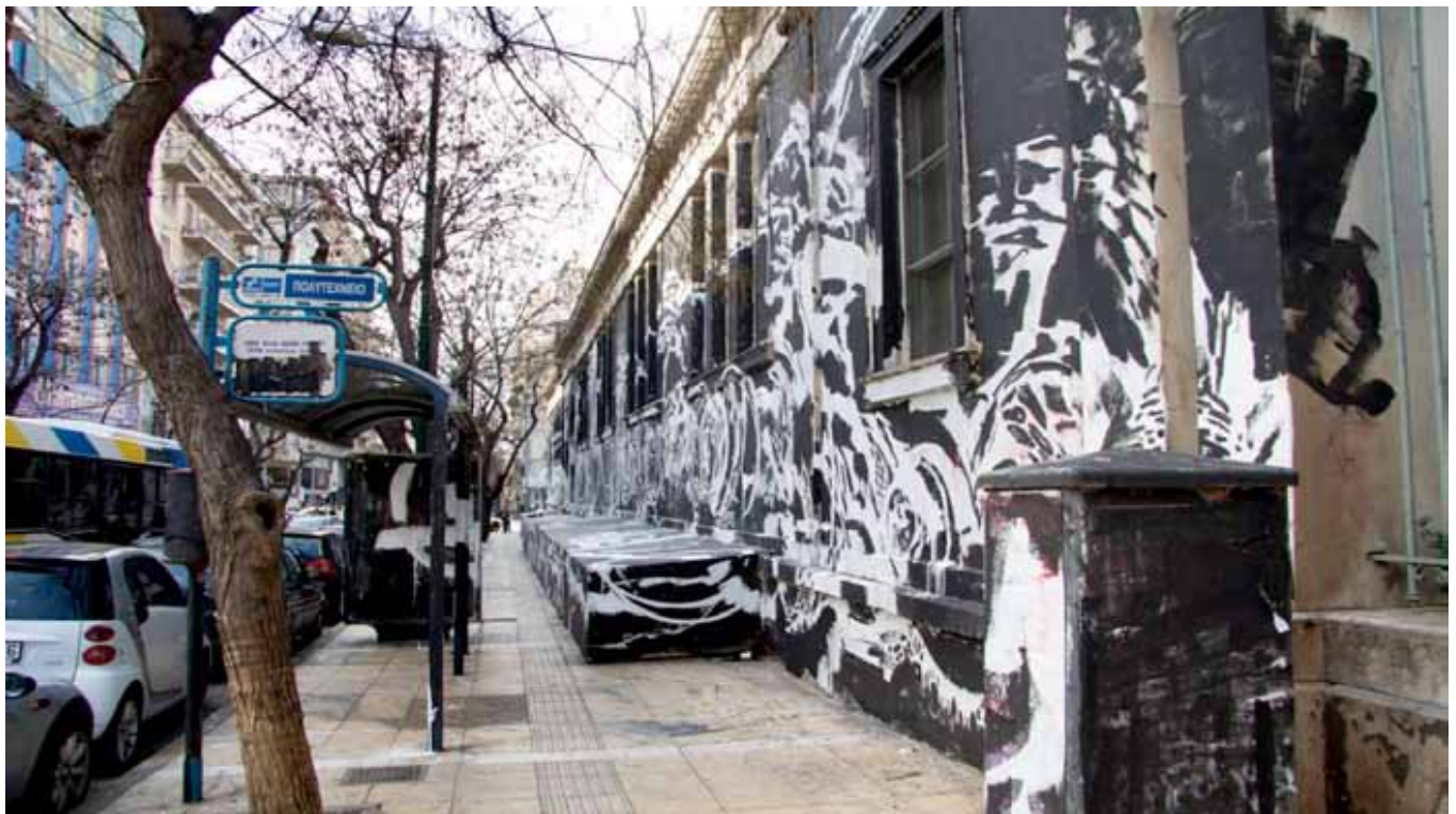
Figure 3 Artwork in Polytechnio. in March 2015