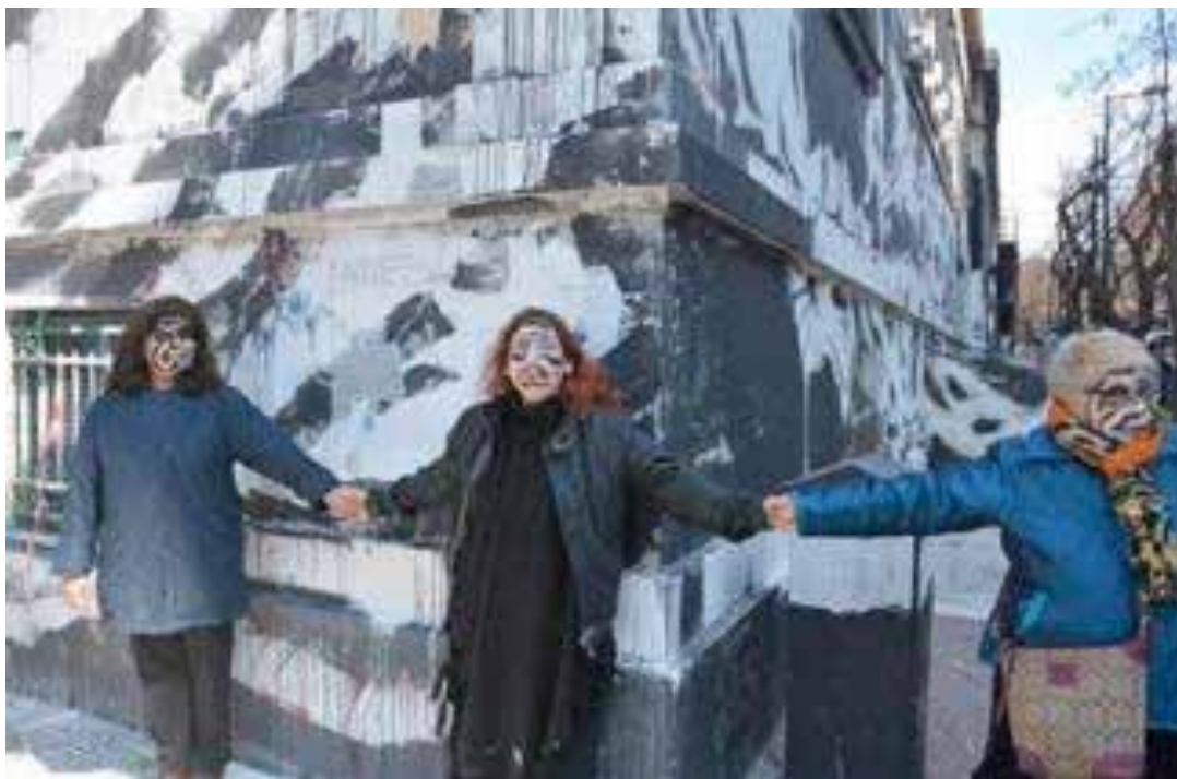
Figure 6 Human chain during the process of the artwork's erasure. in March 2015,

piece as a street artwork vicarious of the Greek crisis. The conservation could have happened only outside institutional frameworks, relied only on grassroots curation, since so far there is no municipal systematic interest in the street art scene in Athens (Chatzidakis, 2016). However, the conservation of the mural does not equate to its plain remaining. In the latter case, the mural would be left exposed to all kinds of interaction, weather and time wear. With either the remaining or the conservation of the mural, an action of maintenance would advocate the uncomfortable ascertainment that the debt crisis is an irreversible part of the recent Greek history. The Doric entablatures and neoclassical design imply the renowned past of the ancient Greek civilisation, while the black and white features of the contemporary mural connote an uncertain indiscernible future. This mural constituted an excellent sample of hybridisation not only between high art and popular culture but also between a distant renowned and memorable past and a repelling poor present. Be it for its indecipherable dark content or for the withering of the neoclassical building, the remaining of the mural participates in the collective narrative of the contemporary Greek identity and represents the unglamorous conditions of debt and decay.