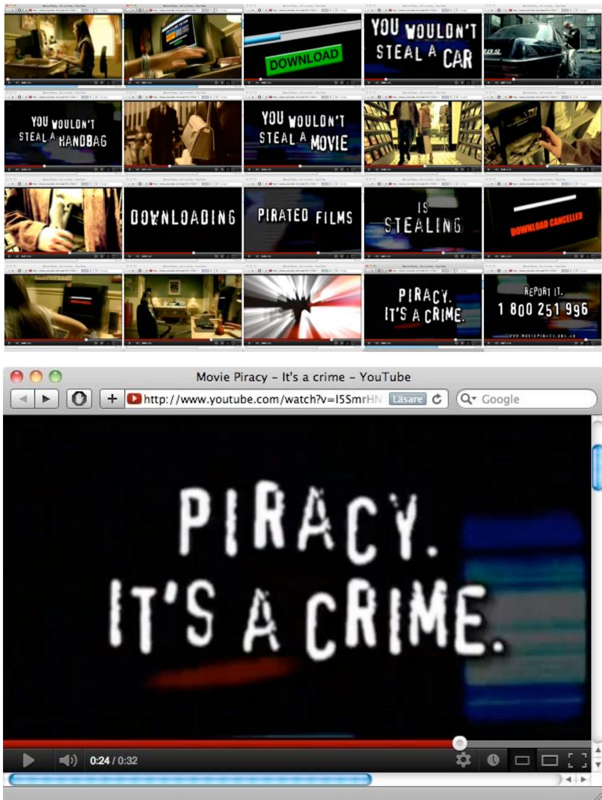
Figure 1. Screenshot storyboard