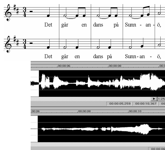
Figure IV. Two performances of the song Dansen på Sunnanö (Evert Taube) showing dynamics and timing of two different singers. The waveform and transcript acted as starting point for discussion on idiomatic style, and the expressive modes of the two recordings.

vocal performance, the expressive qualities of timbre, timing and pitch in the singing could be observed. To do this, graphic representations of spectrograms and pitchgraphs were used, in addition to conventional transcriptions made “by ear”. The conventional transcript presented a basis for orientation of gross timing and pitch, in comparison with both the written sheet music and alternative performances. The transcriptions were illustrative, though staff music would be quantized in ways similar to the quantizations of MIDI software. Comparisons of two performances of the same song were visualized together, as starting points for discussions on relations between semantic content and performance, phrase by phrase throughout the song.