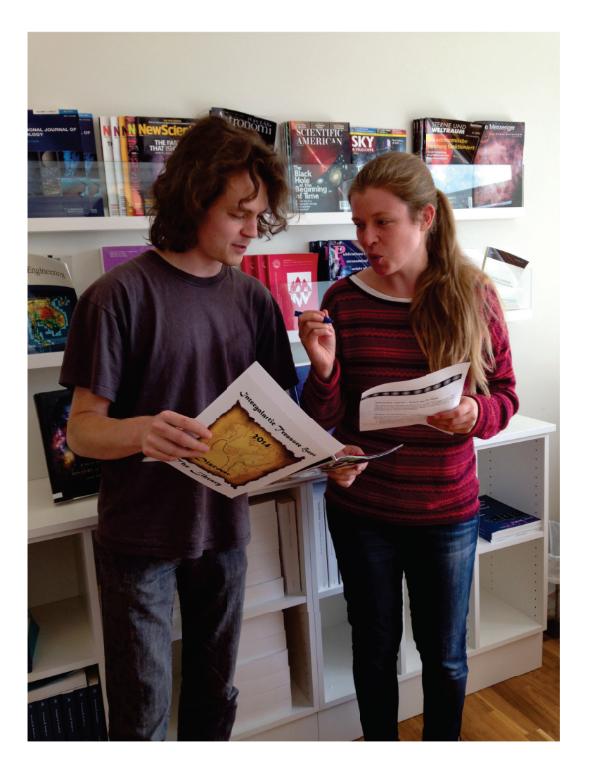
Figure 1. Students have fun working together at the Astronomy library