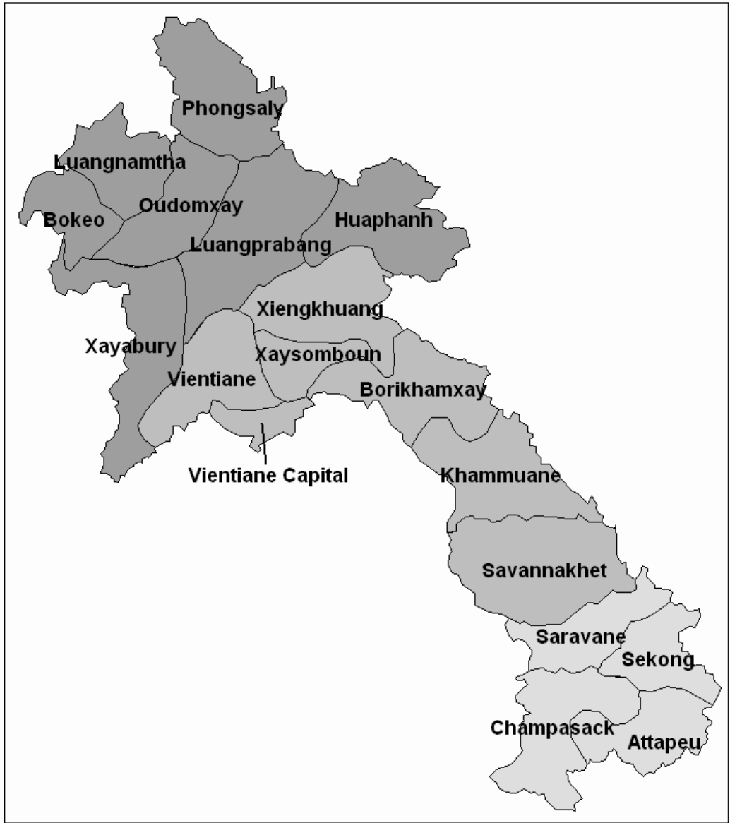
Figure 2: Map of Lao PDR.