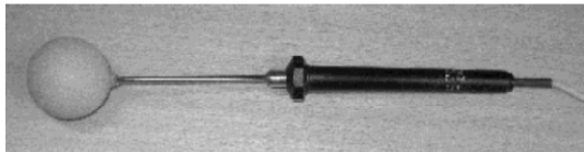
Fig 2. Globe thermometer consisting of a grey 38 mm acrylic ping pong ball around a Pt100 temperature probe [16]

To determine MRT through measurements with a globe thermometer, both the globe temperature (i.e. the equilibrium temperature of the thermometer inside the globe) and the convective heat losses of the globe need to be known. The latter depend on the wind speed. However, if the globe thermometer is large and heavy it may take up to 20 min to reach equilibrium [6]. Thus globe thermometers having a large time constant are not well suited to measure the MRT outdoors where radiative fluxes and wind speed are changing rapidly [6]. The formula to calculate MRT depends on the type of globe, see [14,16]. Ideally the MRT formula should be determined through calibration with three-dimensional measurements of short- and longwave radiation fluxes according to Fig. 1[16]. Moreover, the MRT calculated from a globe thermometer is sensitive to variations in wind speed. E.g. a sudden increase in wind speed will mean that the globe cools down, but as this will take some time to happen, MRT will be overestimated. Similarly a sudden decrease in wind speed will lead to an underestimated MRT. To reduce the sensitivity to wind speed variations, 5 to 10 minute averages should be used in the calculations of MRT [16].