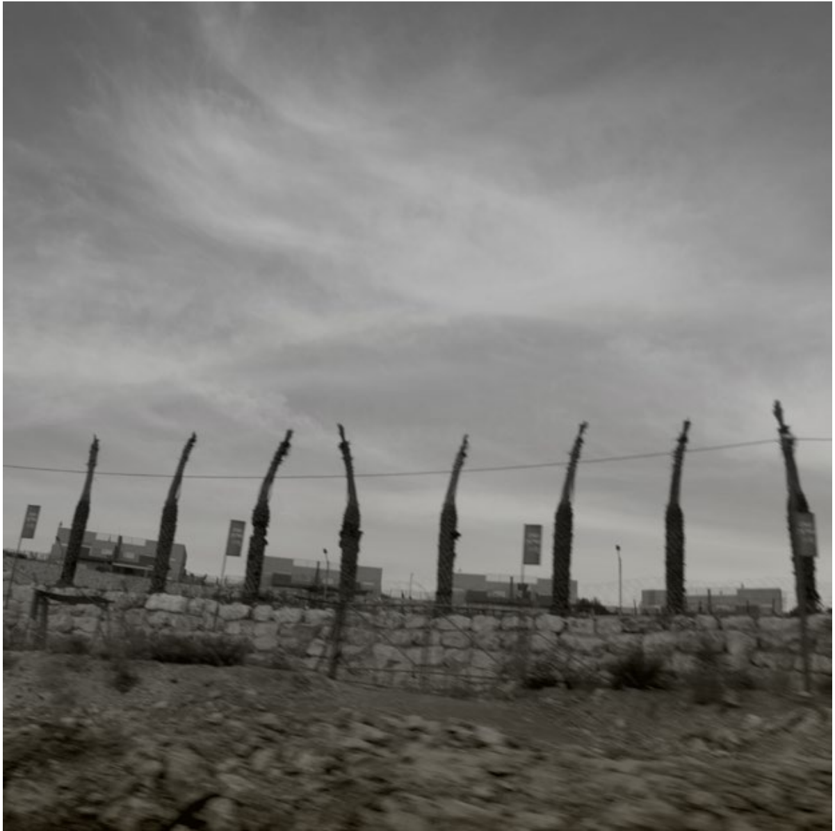
Dissonans / 1.1