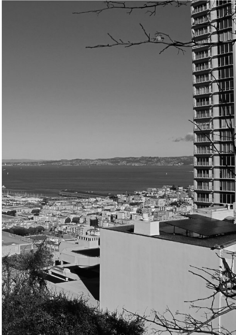
San Francisco, Vacation, 2012. Panorama from Russian Hill, San Francisco, California, 2012.