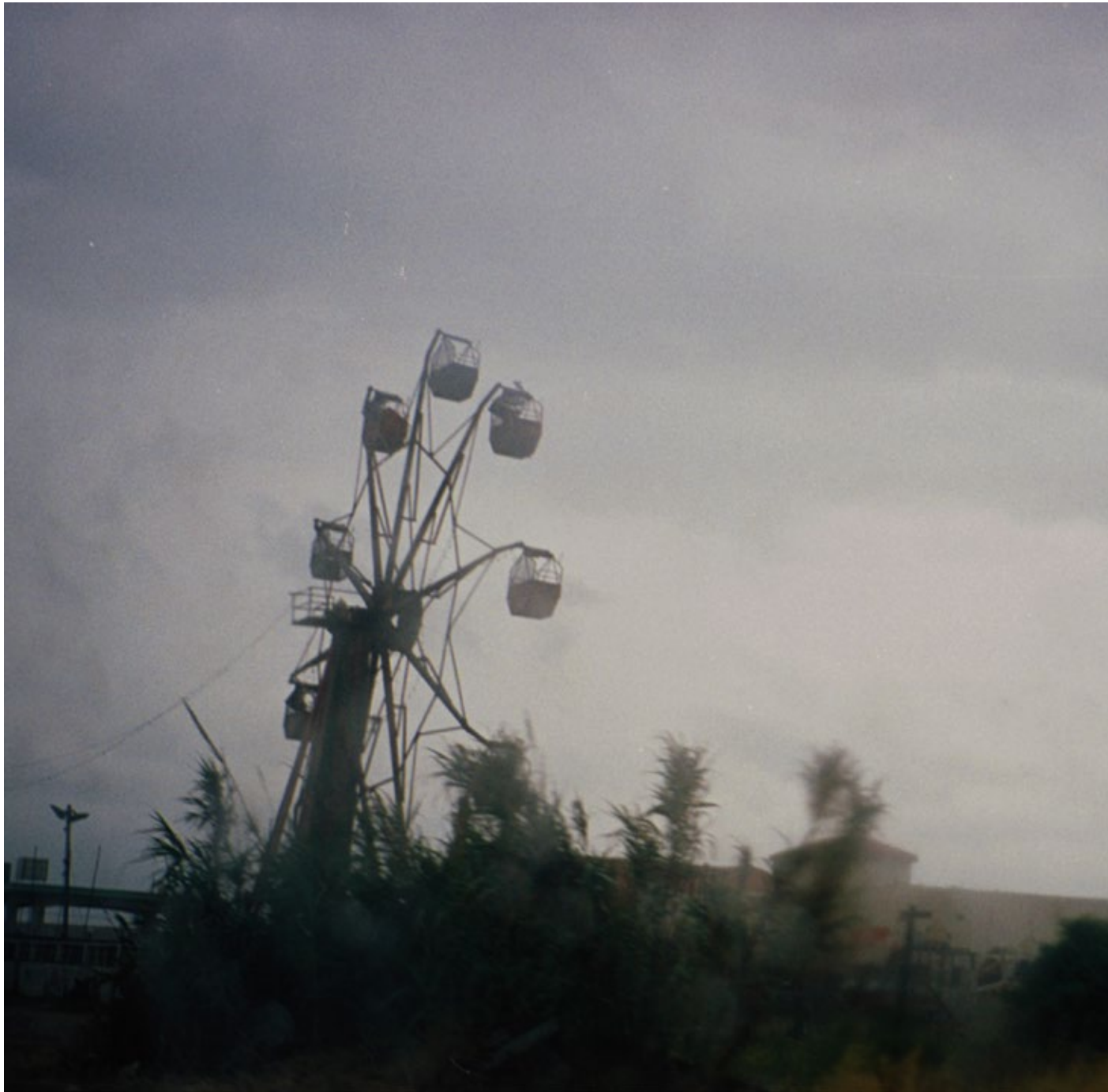
Ferris Wheel in Gaza, May 2003.