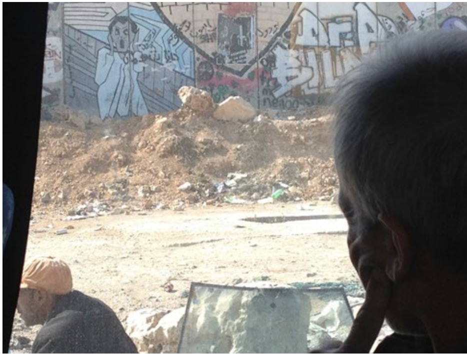
En Palestinsk man på väg genom Qalandiya checkpoint.