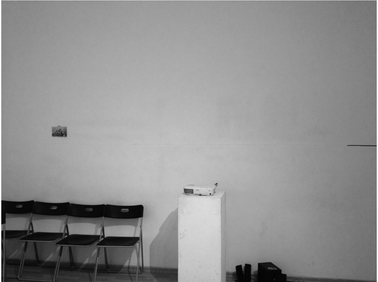
The Art Museum at the International Academy of Art Palestine in Ramallah, where the Picasso painting Buste de Femme (1943) was shown in 2011 as part of the project Picasso in Palestine by Khaled Hourani. Photo: Jesper Nordahl, 2012