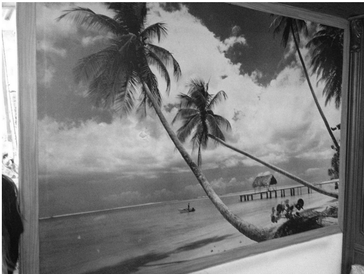
Wall Paper at Benji's place, Betlehem. Photo: Jesper Nordahl, 2012