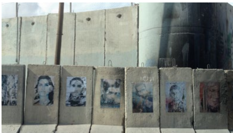
Video stills from Terrain Vague , 2013 .