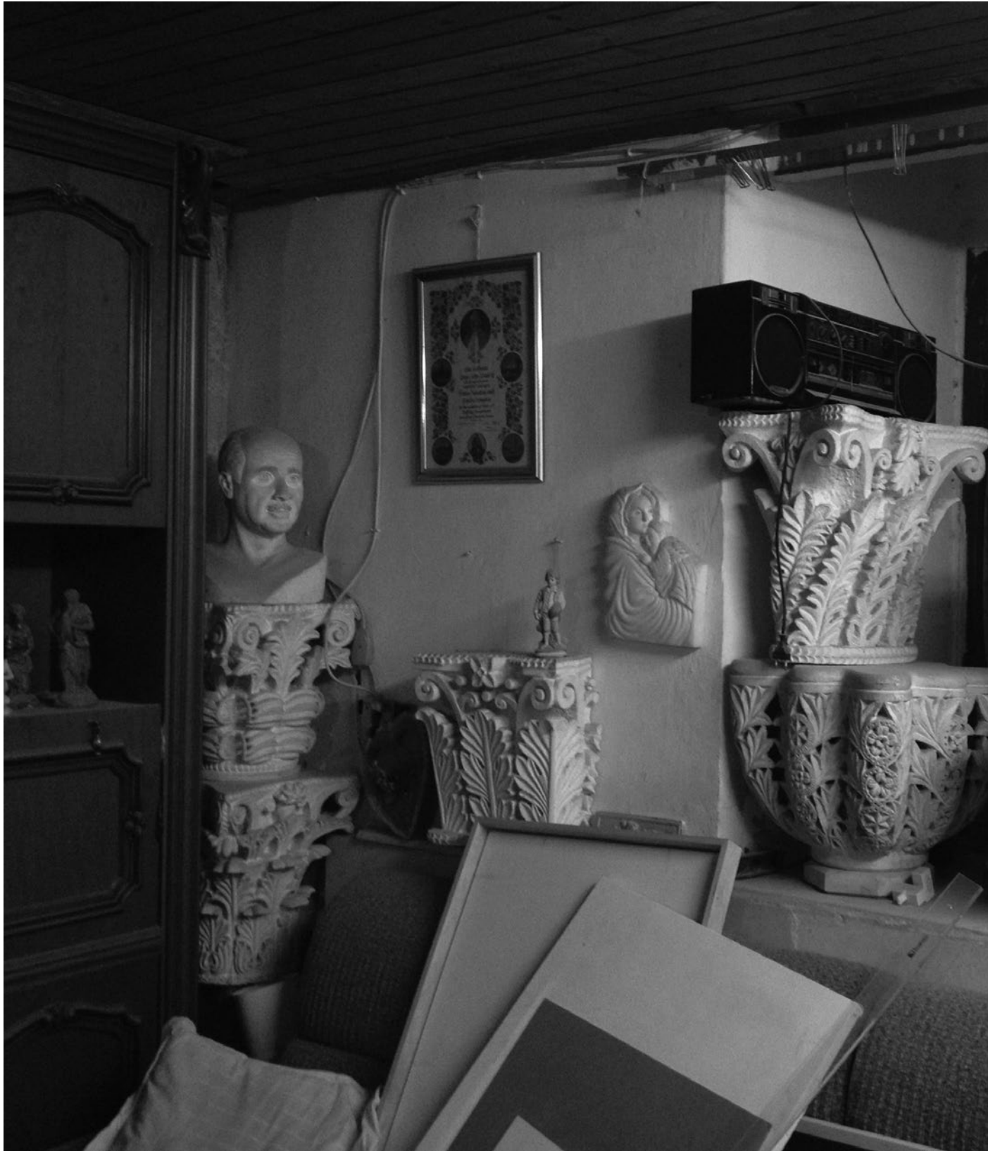
Benji's place, Betlehem. Photo: Jesper Nordahl, 2012