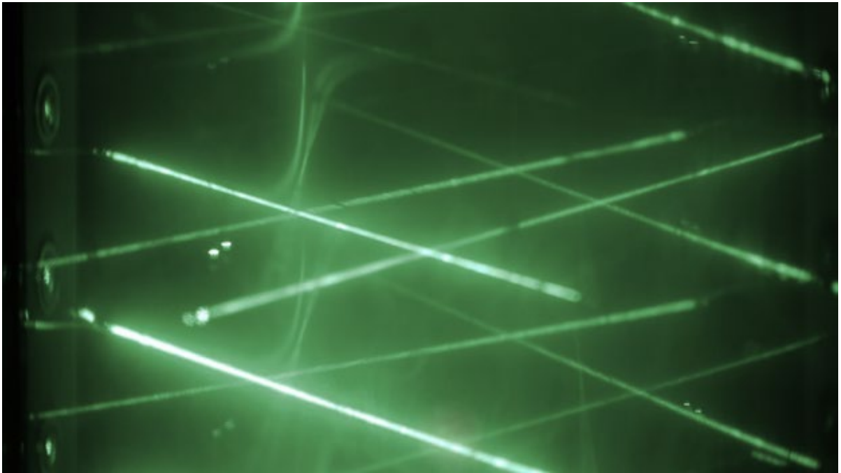
Video still from Subatomic particles , 2012 .