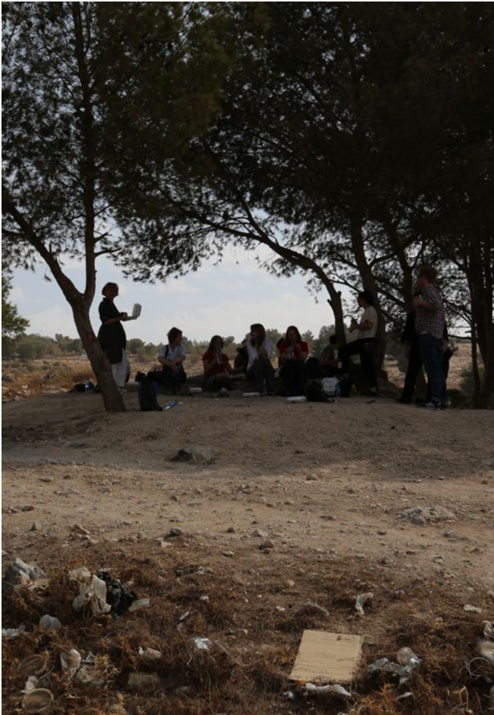
Art & Architecture picnic at Mount Nebo, Jordan 2012.