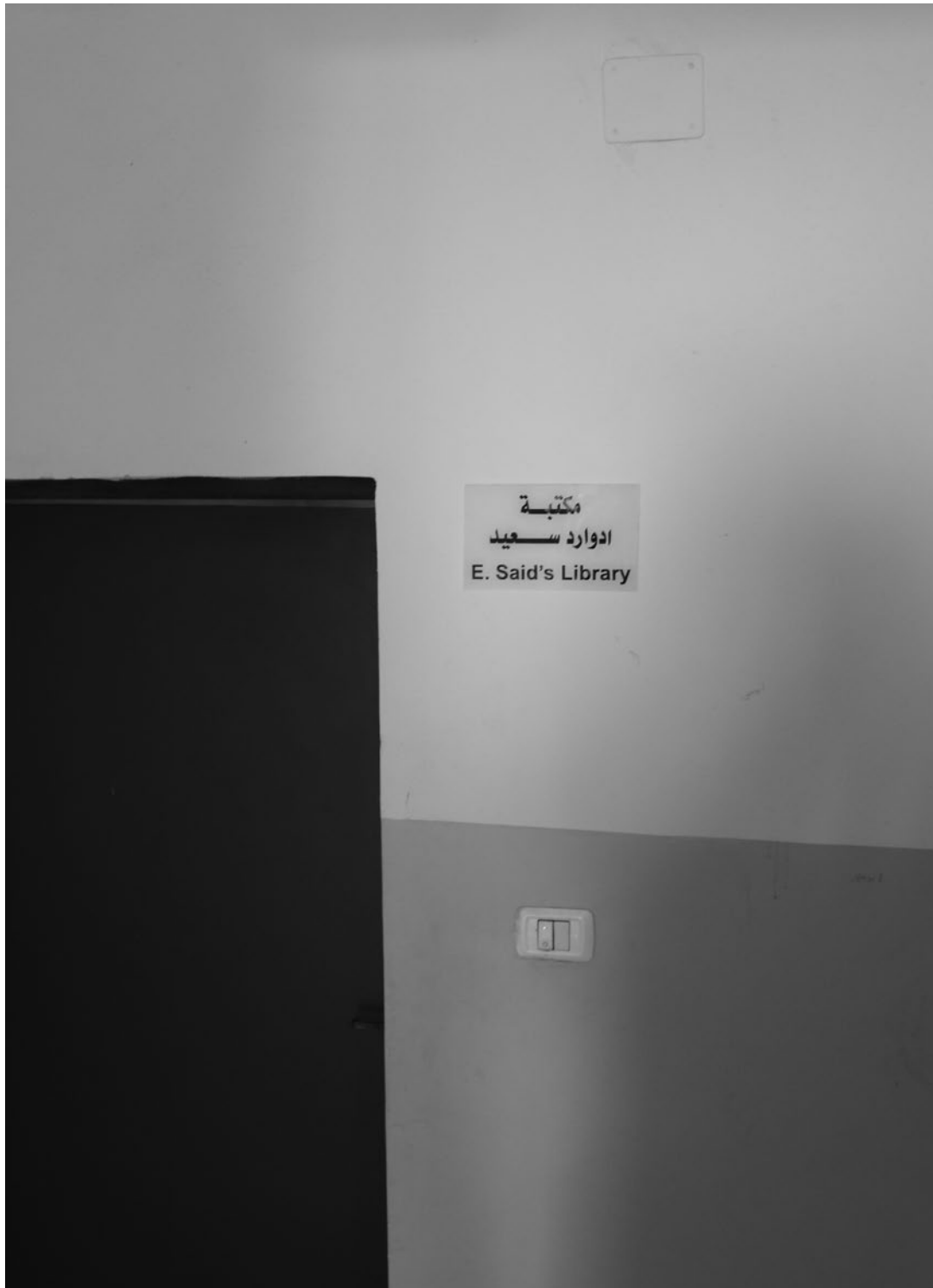
Phoenix Centre (where the headquarters of Campus in Camps is located), Dheisheh Camp. Photo: Jesper Nordahl, 2012