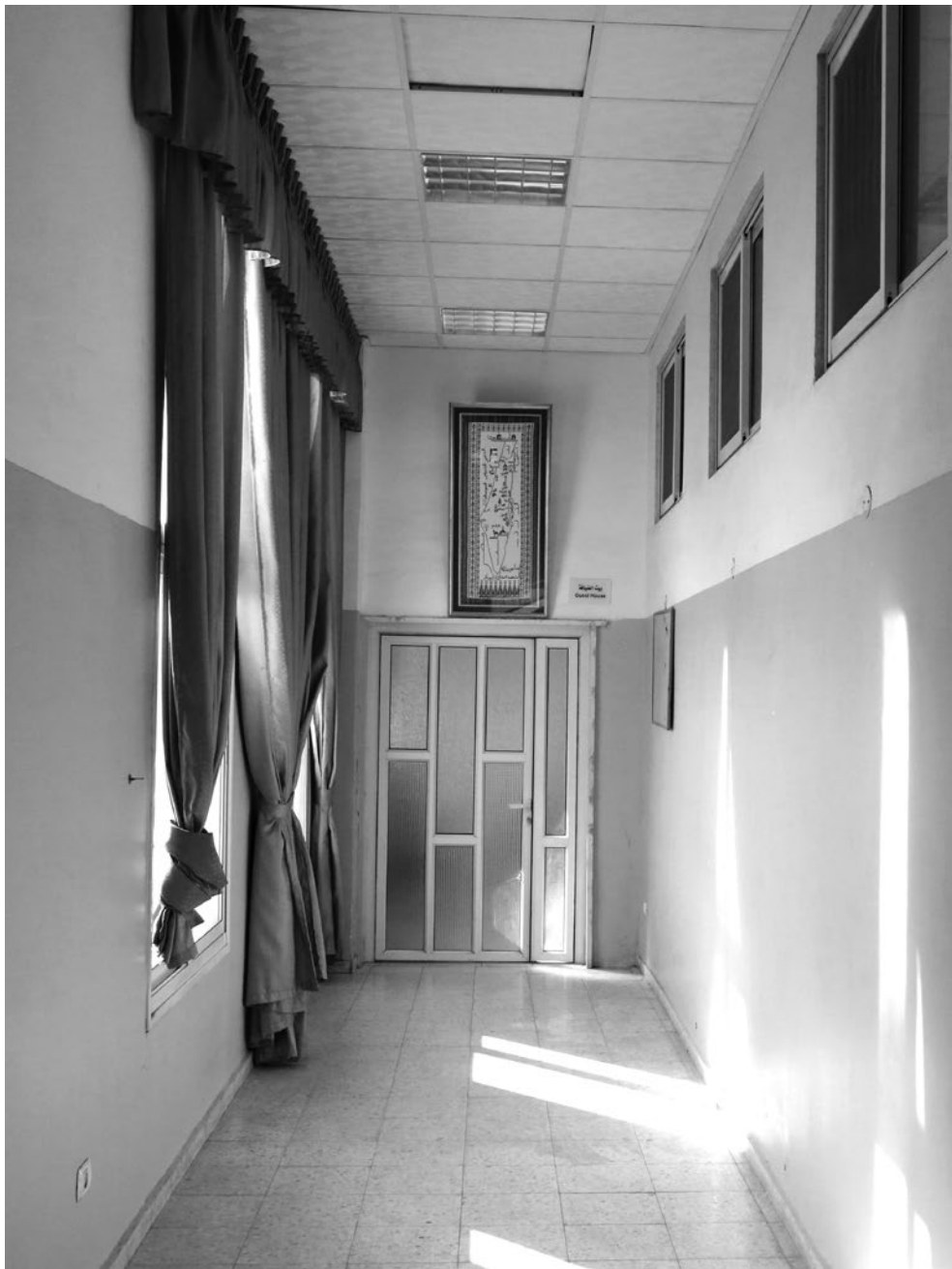
Phoenix Centre (where the headquarters of Campus in Camps is located), Dheisheh Camp. Photo: Jesper Nordahl, 2012