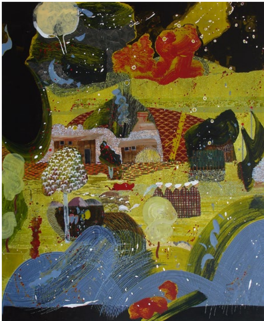
Underströmmar, akryl på plåt, 117x96