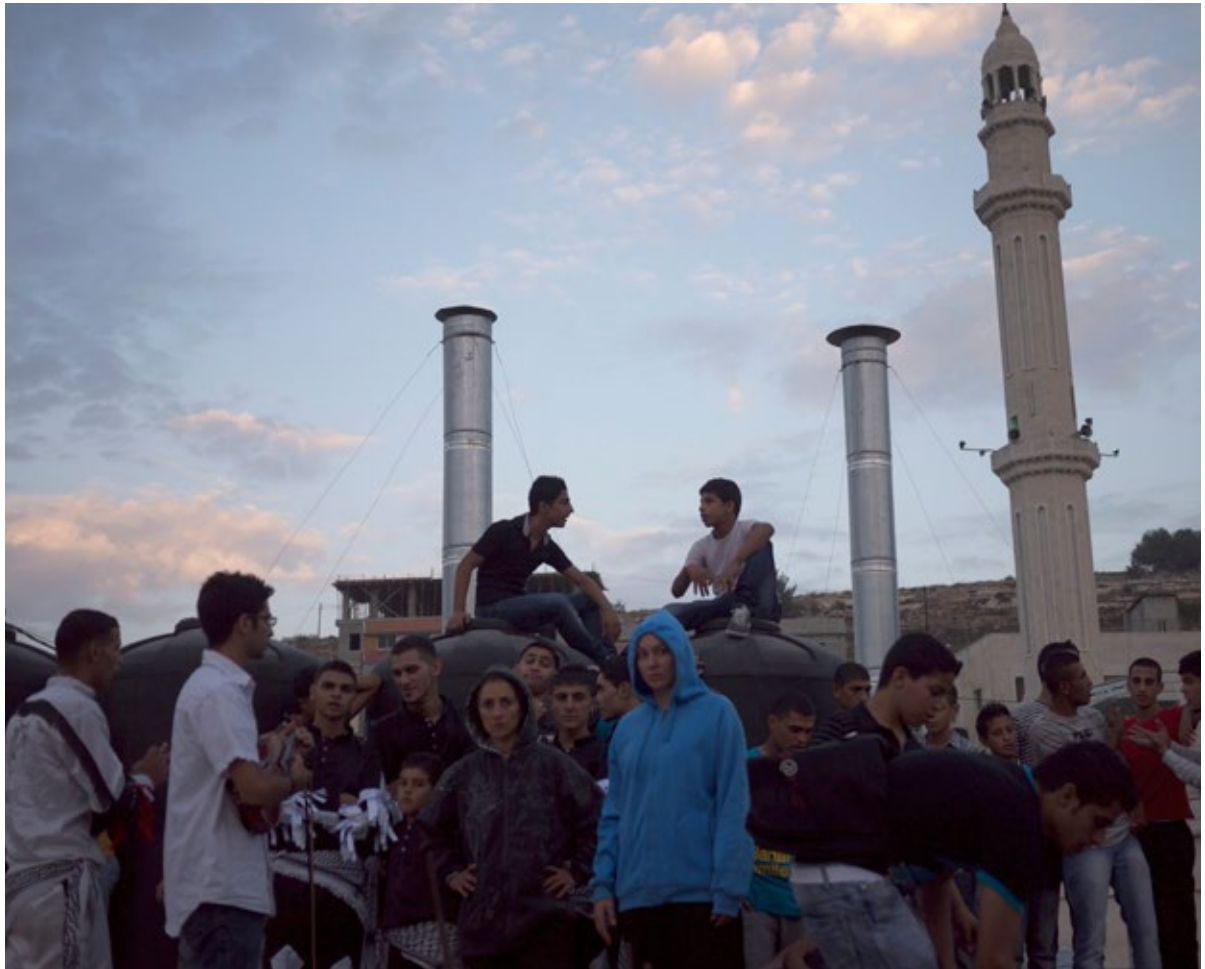
From the art project "Vertical Gardening" 2010, Jalazoun refugee camp, West Bank, Palestine.