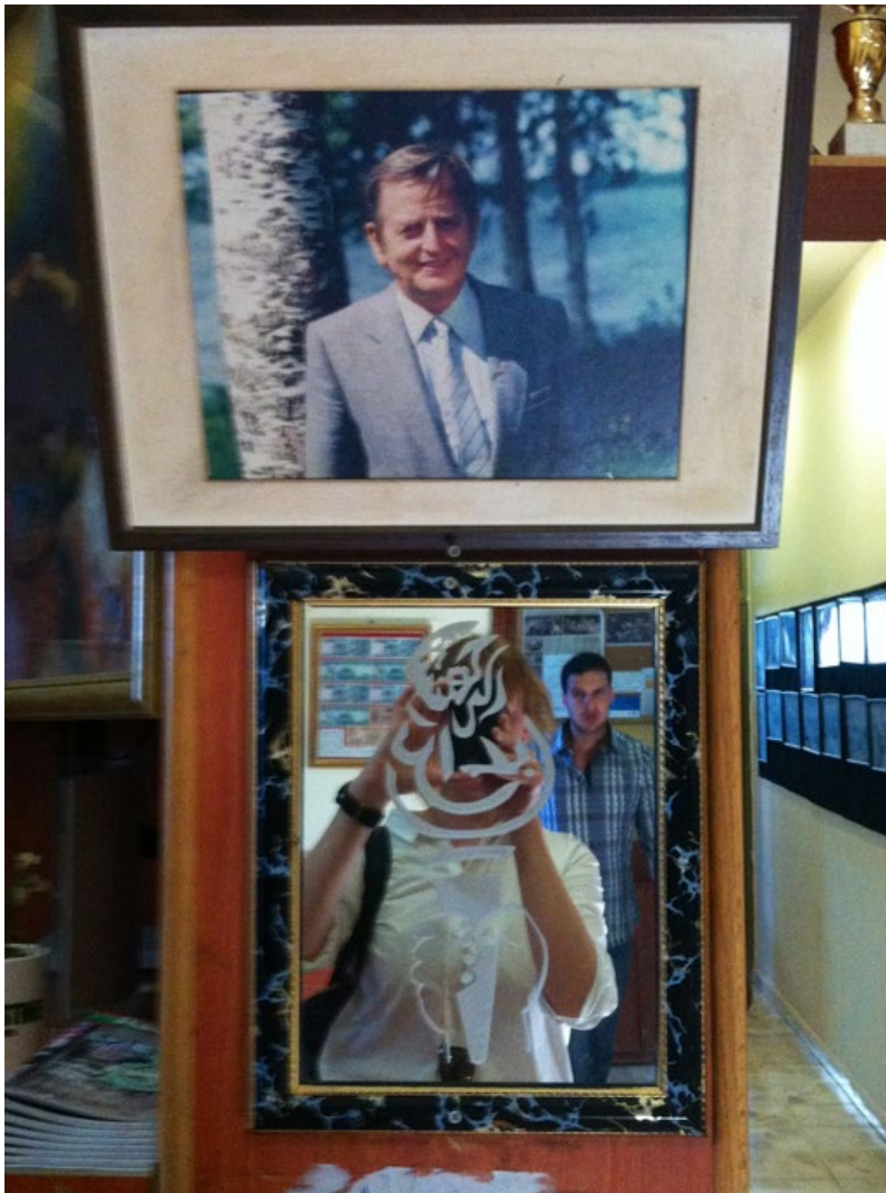
Ibdaa Cultural Center, Dheisheh Refugee Camp, Palestine, Nov. 2012.