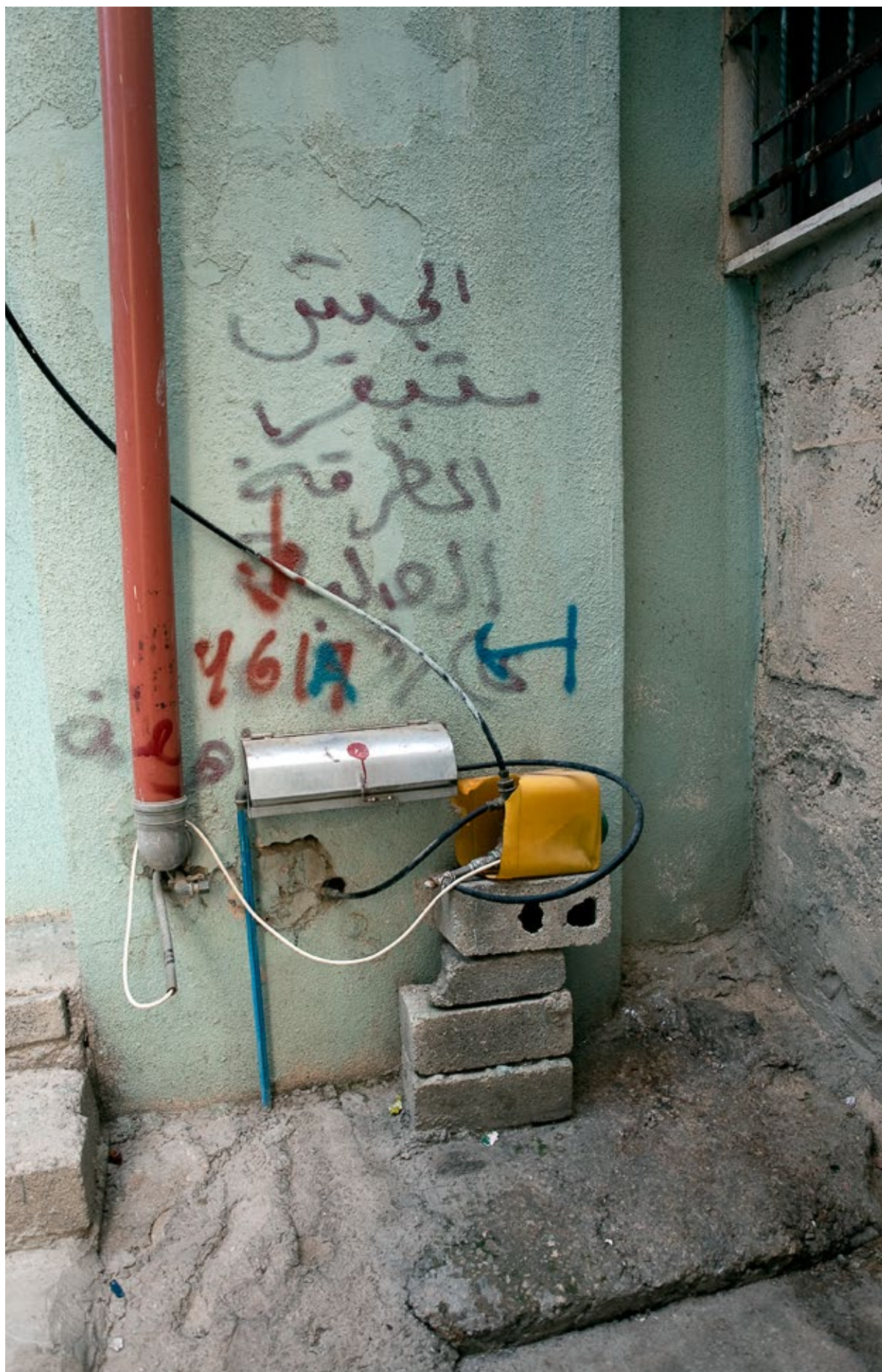
Dheisheh refugee camp.