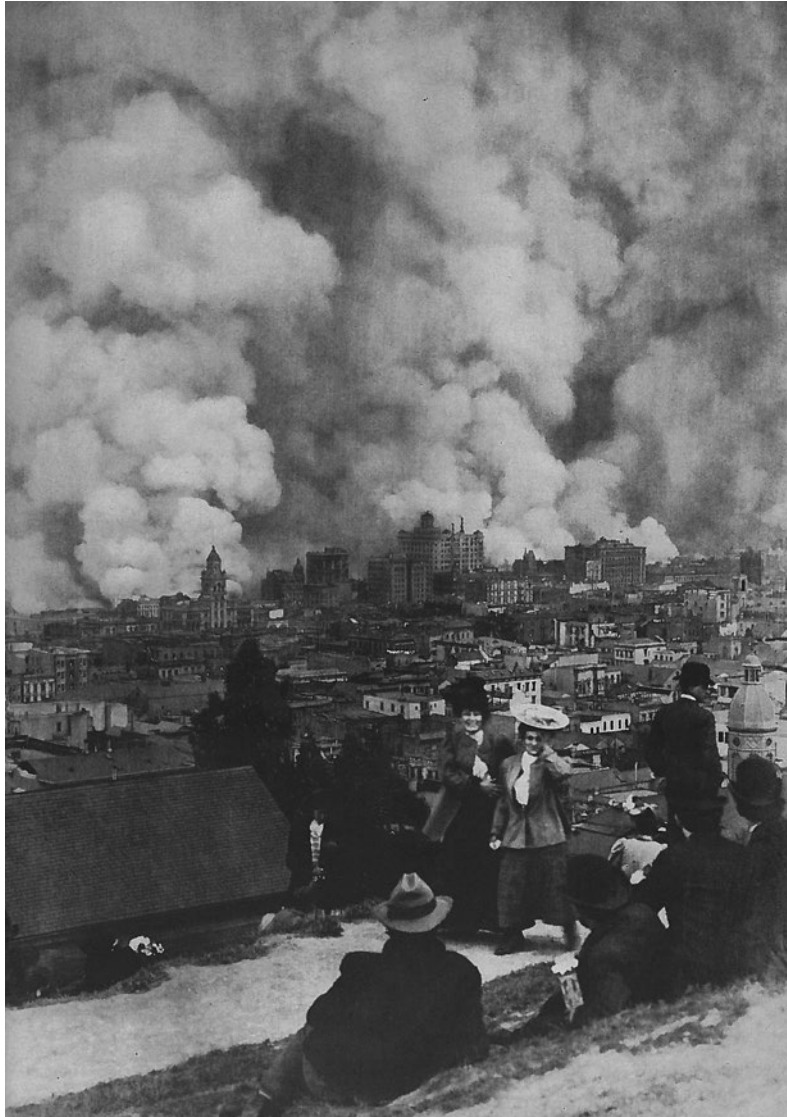
San Francisco Earthquake, 1906. Panorama from Russian Hill, San Francisco, California 1906.