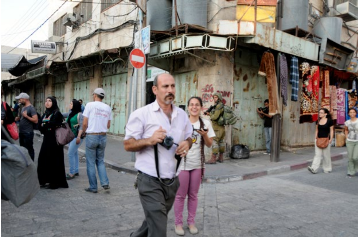
Hebron, November 2012 . Photo: Mandana Moghaddam