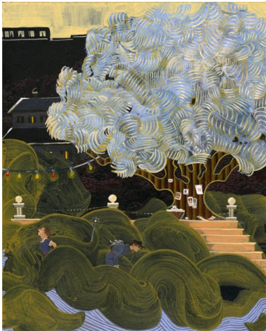
Sakletarna, akryl på plåt, 26x21