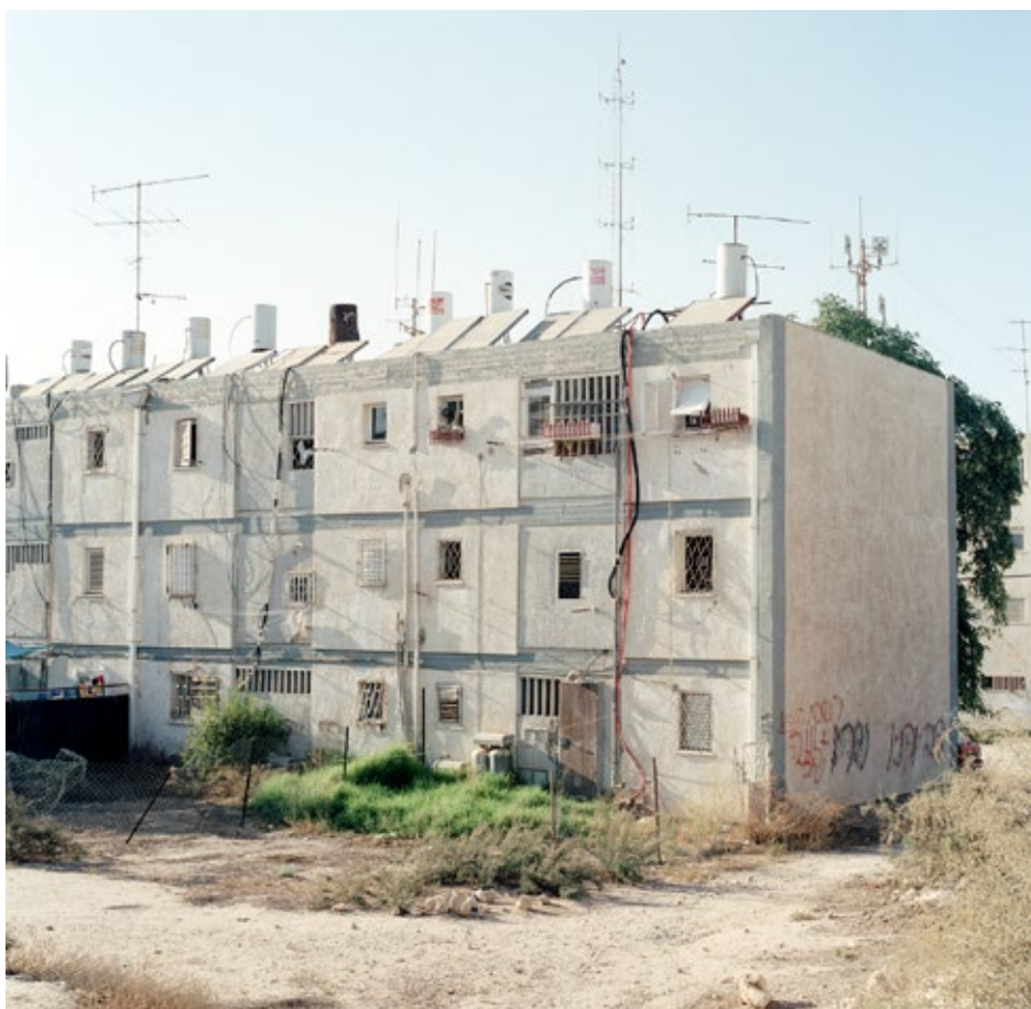
A Place to Call Home, 2006