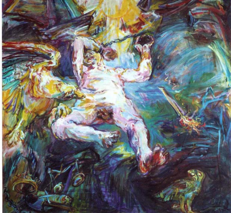
Figure 7. Oskar Kokoschka: "Prometheus". Right-hand canvas, 239 x 234 cm.

grain and agriculture ("mother-earth"), in a graceful, protective gesture, full of strength, seemingly embracing the moonlit earth (figure 8).