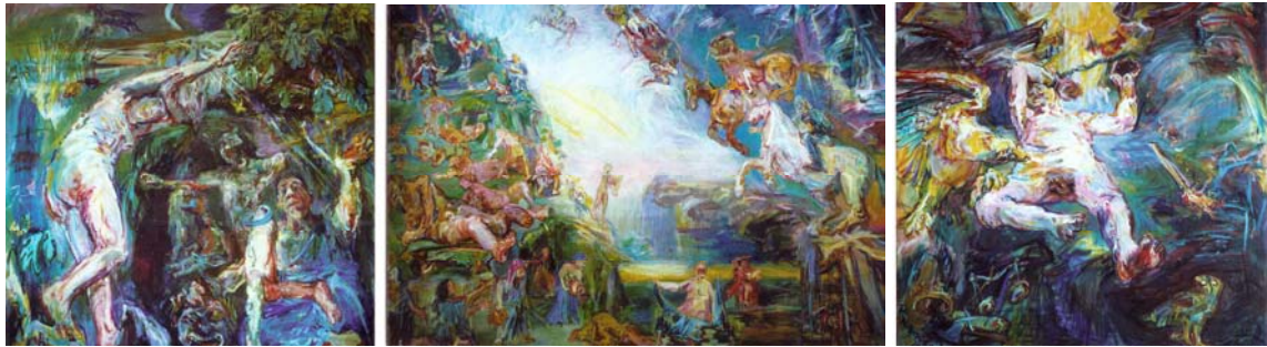
Figure 6. Oskar Kokoschka: "The Prometheus Triptych" (1950). Oil painting, 817 x 239 cm.

Now, let us consider a work of art, which certainly has a quite different, and more profound, aesthetic as well as moral dignity, namely Oskar Kokoschka's "The Prometheus Triptych" (1950, figure 6). 19