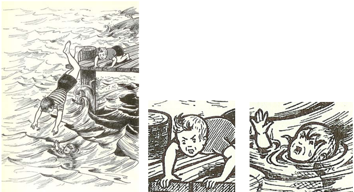
Figure 5. From Maxwell (1966).

However, not anything goes. Take, for example, a look at the following two pictures taken from a children’s book by Arthur Maxwell, a Christian author of morality tales that illustrate values such as honesty, diligence, obedience, and selflessness. Figure 5, embedded in such a fictitious story, shows a scene which seems to suggest the principle that it is morally right to help people in situations of distress. 17