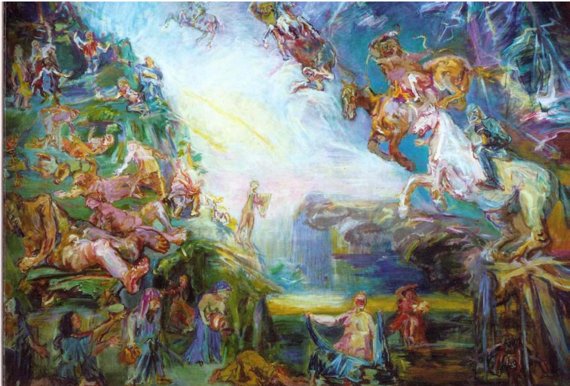
Figure 9. Oskar Kokoschka: "The Apocalypse". Centre canvas, 239 x 349 cm.

On her right side, her daughter Persephone, having been captured by Hades, the god of the dead, springs upwards into the safety of Persephone's protection. Hades' face is interestingly Kokoschka's own self-portrait, expressing compassion rather than threat, and seemingly releasing her, maybe even propelling her upwards. In his right hand, he brandishes the severed head of Medusa. The central Apocalypse canvas shows an even more striking scene (figure 9).