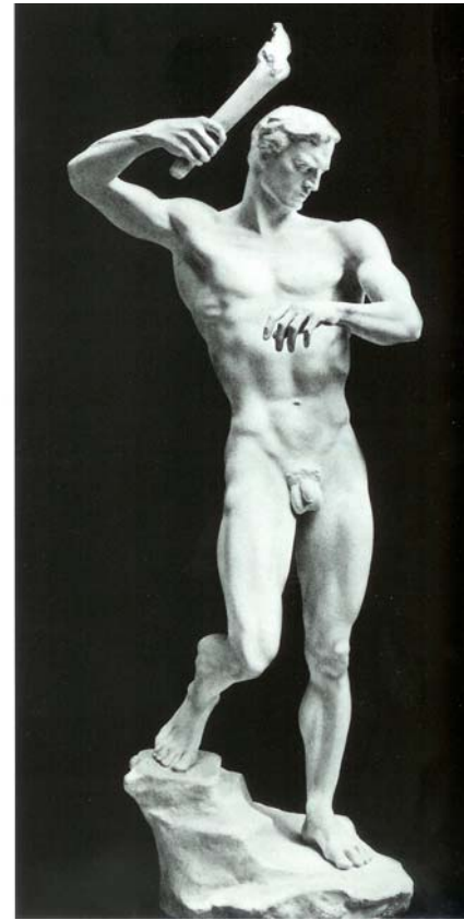
Figure 11. Arno Breker: "Prometheus"(1935).

In both cases neo-classicist influences are evident, and these sculptures can thus hardly be said to display any remarkable innovative aesthetic qualities or visual intricacies, at least not compared to many other works of Western art produced during that period of time. Moreover, the context of their production seems also to be crucial for interpretative as well as moral reasons. Actually, both of them were made in Nazi Germany, and Thorak and especially Breker were some of the most prominent Nazi artists, endorsed and rewarded by the authorities, not least by Hitler himself. With this background in mind, the implied message becomes certainly more obvious as well as morally dubious. Thus it seems reasonable to assume that these sculptures have been intended to glorify certain racial ideals, emphasizing the positive values of power and strength as well, by implication, the heroic superiority of the German or Aryan race and social Darwinist ethical beliefs ("might is right"). If we compare Kokoschka's work to these sculptures, a significant difference can easily be discerned, quite apart from any clear-cut aesthetic or