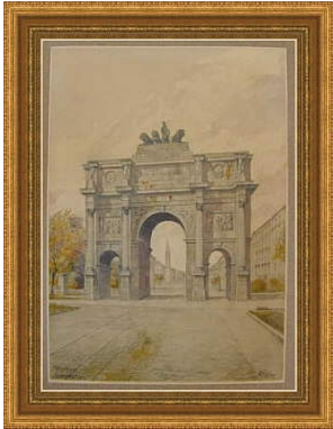
Figure 4. Adolf Hitler , painting date unknown.

Although we immediately can notice that these pictures are visually identical, it seems also quite probable that our response to and appreciation of them varies dependent on whom we think might be the creator (and actually this is a painting by Hitler). 11