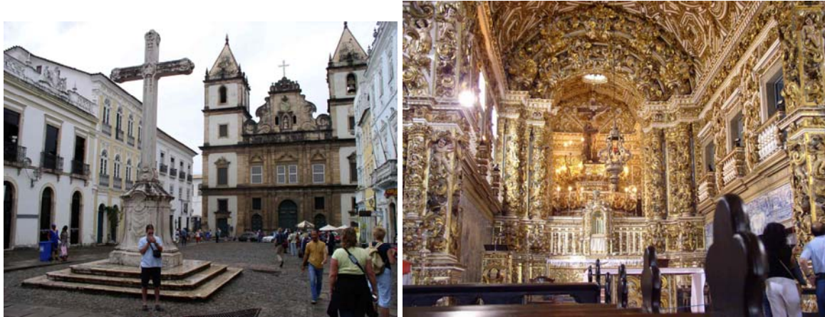
Figure 1. Church "São Francisco" (1708-1750); Salvador, Brazil. The interior walls of this church have been covered with c. 750 kg gold.

(see figure 1). 9 In general, the decision to produce art with high expenses and thus omitting to invest the economic resources involved to improve the living conditions or the welfare of larger groups of people could be regarded as morally dubious or even unacceptable. Was actually Louis XIVth' decision to spend a fortune on building the castle of Versailles morally justifiable, while at the same time a large population in France was starving? Numerous further examples on these lines throughout history could of course be mentioned.