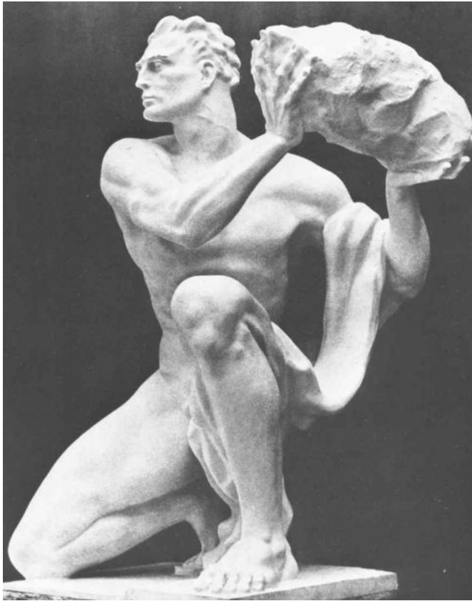
Figure 10. Josef Thorak : "Prometheus" (1943).