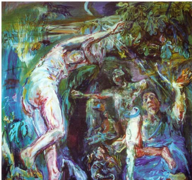
Figure 8. Oskar Kokoschka: "Hades, Persephone, and Demeter". Left-hand canvas, 239 x 234 cm.

grain and agriculture ("mother-earth"), in a graceful, protective gesture, full of strength, seemingly embracing the moonlit earth (figure 8).