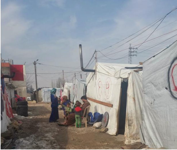
Figure (2) Spaces where men gather to socialize and to have coffee or tea.

-Semi public or private spaces that is threshold between the private realm of the tent and the public realm of the areas around it. This in-between space is where refugee has the capacity to control the amount of interaction. This threshold is just an edge which is the membrane of the tent itself. In some cases especially in Tolyane camp in Lebanon, some of the tents have expanded this space using elements such as curbs or planters or even light structures from wood and cardboard sheets.