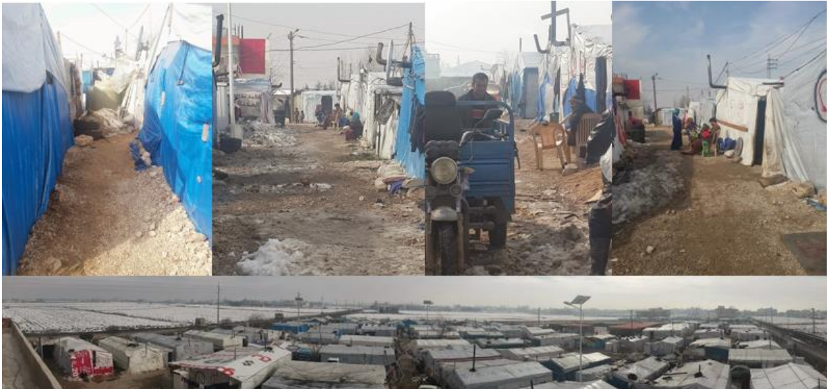
Fig 1: Collage images for Tolyane refugee camp in Lebanon one of the case studies.