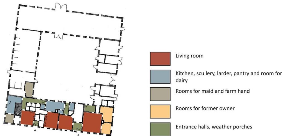
Figure 6: Layout of Abeline's Farm including organization of rooms in the farmhouse