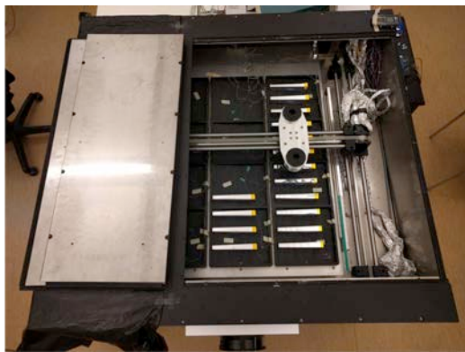
Figure 1: The test bench for CALIFA Barrel crystals in the Lund university detector laboratory. Batches of up to 32 crystals can be scanned per test with a rate of 5.2 detectors per hour.

A test bench has been constructed for acceptance test of CsI(Tl) detector elements for the CALIFA calorimeter [1] for R 3 B. A detector module consists of an APD and a long tapered CsI(Tl) crystal wrapped in ESR foil. The geometry is a consequence of the requirement to have high granularity, to achieve the necessary angular resolution for Doppler correction, and the need to be able to register high-energy charged particles that emerge from the reactions.