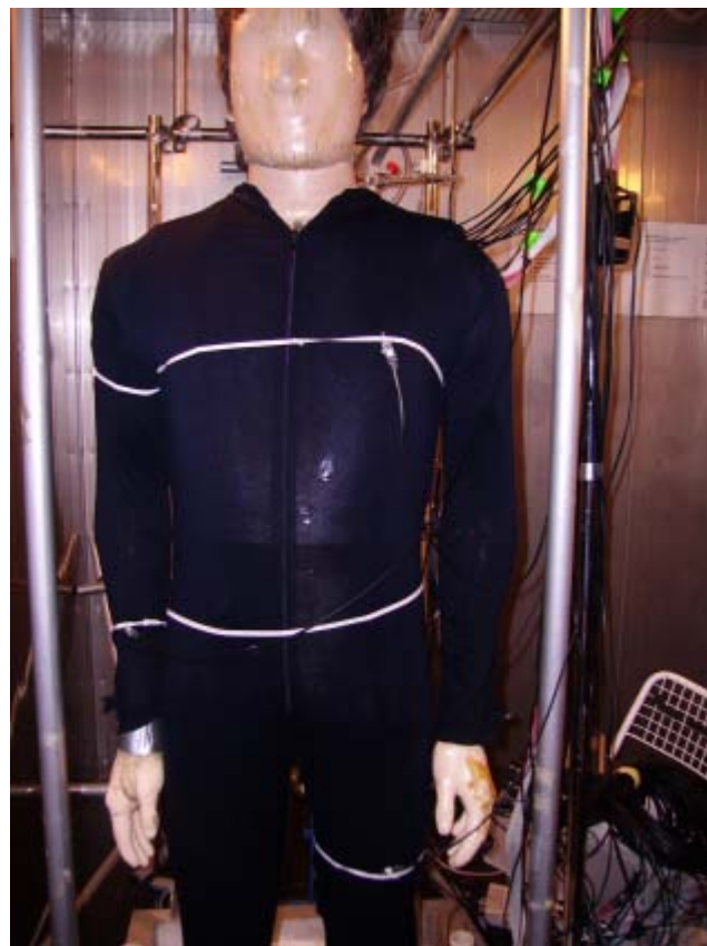
Figure 1 The thermal manikin ‘Tore’ in the climatic chamber.

evaporative heat loss, as radiative and convective gradients will be zero.